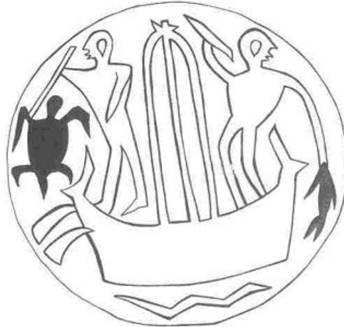
Figure 2. Impression from a cylindrical seal found in Hamad Town, Bahrain, from the Dilmun period (from Vine 1993: 53).