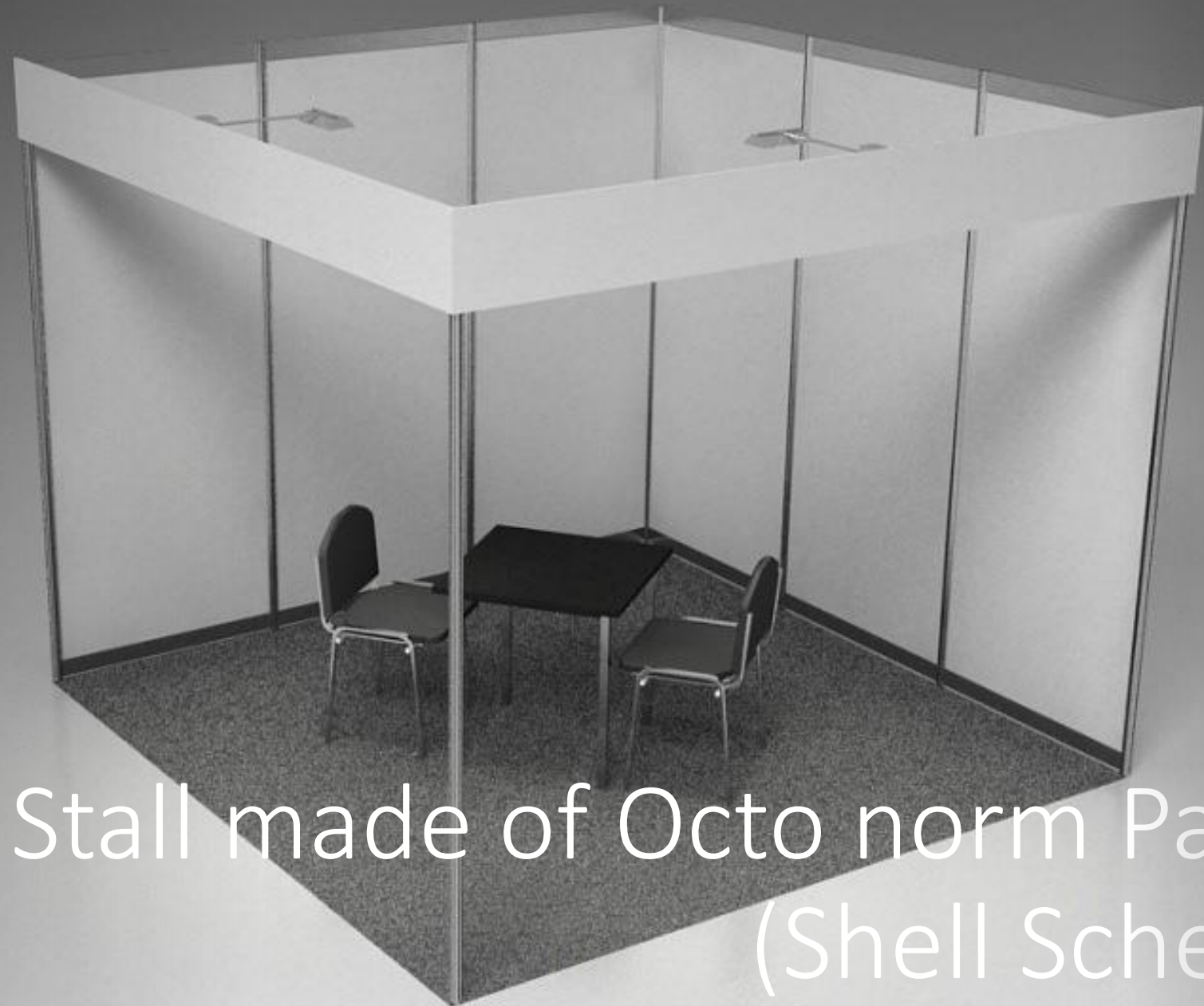
Stall made of Octo norm Panels (Shell Scheme)