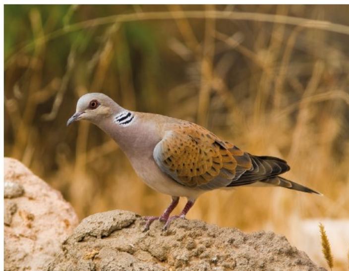
Turtle Dove