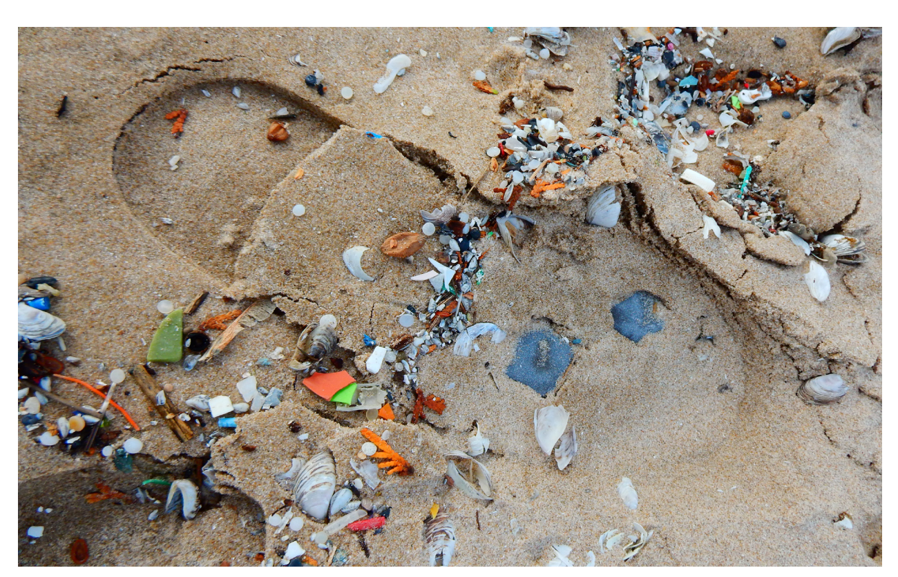
Figure 1. Plastic items of various sizes on a beach.

will continually change. These varying environmental concentrations will significantly influence exposure of organisms to microplastics over time<sup>47</sup>. For example, some areas will be natural accumulation zones, and many will also be seasonal in relation to rainfall and flow conditions. For example, in the UK, microplastic concentrations in river sediments were found to be much reduced following flooding, leading to resuspension of microplastics from sediments and subsequent flushing of microplastics downstream<sup>48</sup>. In the Ganges, the concentration of microplastics was found to increase with increasing distance from the source of the river, with the highest concentrations found towards the estuary, although in a similar concentration range to other freshwater studies<sup>4,49</sup>. With respect to seasonality, it would be expected that the monsoon would have a significant influence on microplastics transport and mobilisation and thus water concentrations; the same study found that surface water concentrations of microplastics were higher pre-monsoon, likely due to monsoon rains diluting and flushing out microplastics<sup>49</sup>.