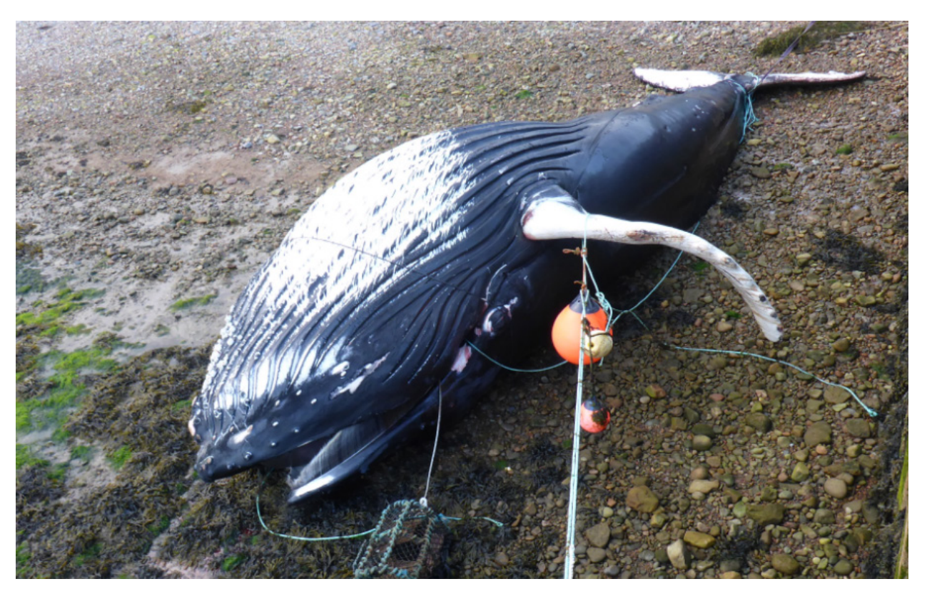
Figure 4. Dead Humpback Whale (Megaptera novaeangliae) (CMS-listed species found globally, including Pacific and Indian Oceans) entangled in fishing lines.

Evidence relates not only to the physical presence of ingested plastics but also indirect evidence of ingestion. In Norway, Harbour porpoises were found to contain phthalate chemical derivatives (resulting from plastic additives, thus acting as an indicator of plastic exposure) within their livers. These chemicals were shown to lead to a reduced body size. These studies therefore show both direct and indirect consequences of plastics and associated chemical contaminants to this CMS-listed species in the wider environment 126. Another marine mammal on the CMS list in the region of interest is the dugong (Dugong dugon), which have been shown to become entangled in fishing nets and drown<sup>127</sup>, in addition to ingesting plastics, leading to death 128. In general, interactions of cetaceans (including whales, dolphins and seals) with plastics are much more widely reported within marine systems than freshwaters (Fig. 4)129-131