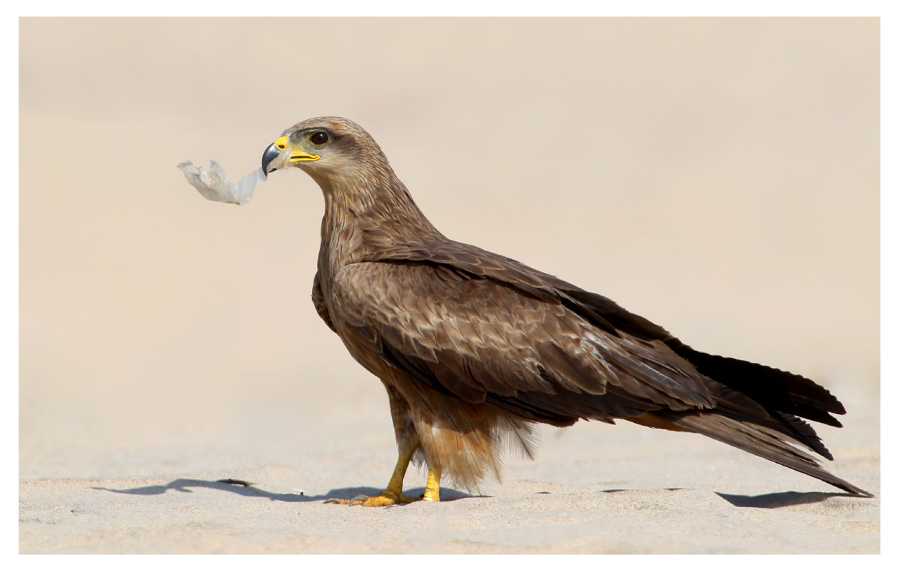
Figure 8. Black Kite with plastic in its beak, possibly being collected for nest construction.

Fishing line also poses a threat for other waterbirds and land birds, when incorporated in nest construction and when birds forage in habitats near wetlands. Kite strings are especially an issue for land birds, and have been estimated as the second most frequent source of plastic interaction after fishing line<sup>151</sup>. Regarding entanglement of coastal and river-dependent birds, the CMS-listed coastal