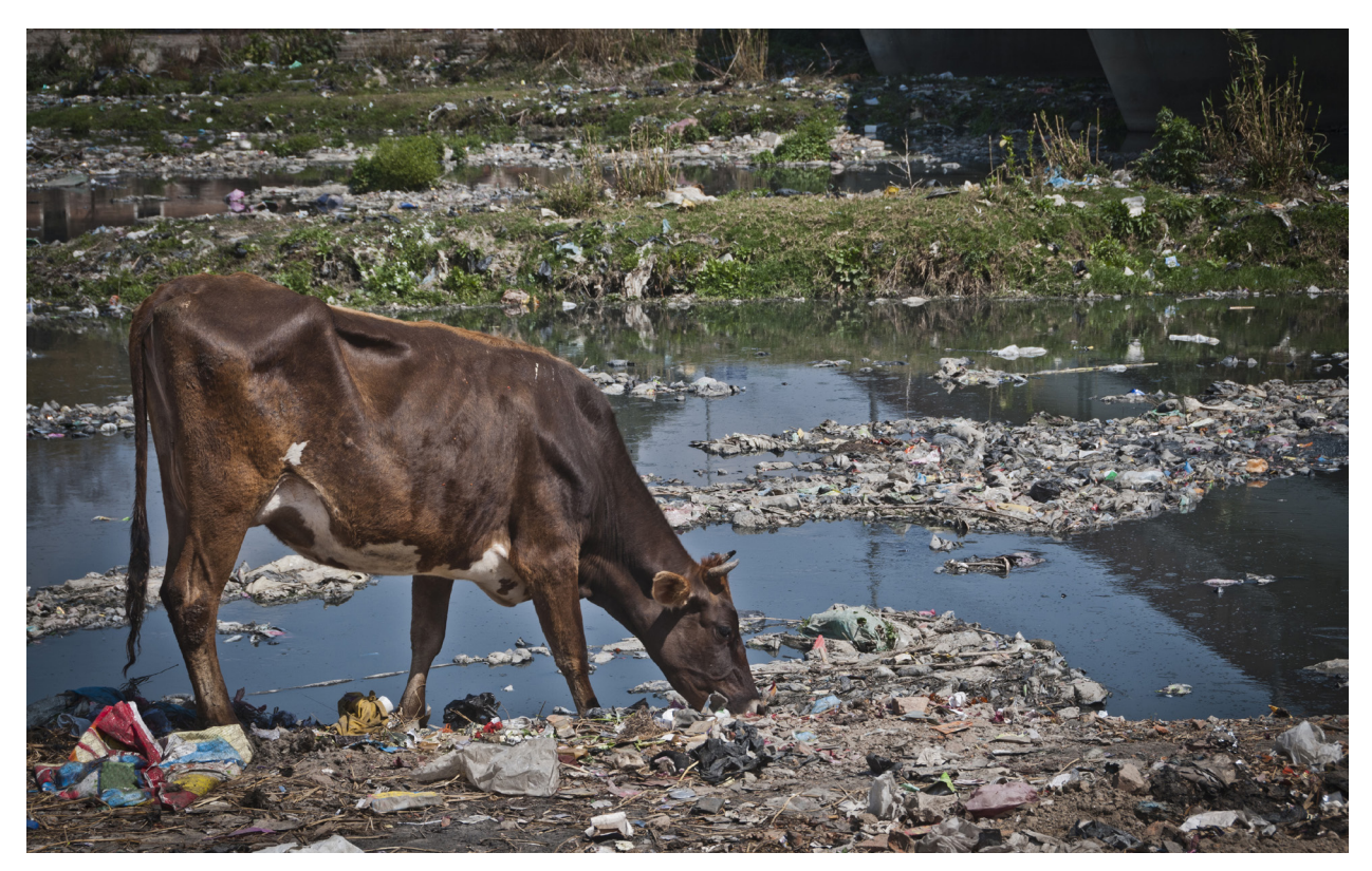
Figure 5. A cow feeding amongst waste on the banks of the Bagmati River, Kathmandu, Nepal.

An example of land mammals in Asia (and elsewhere) affected by plastic ingestion are ruminants such as cows,