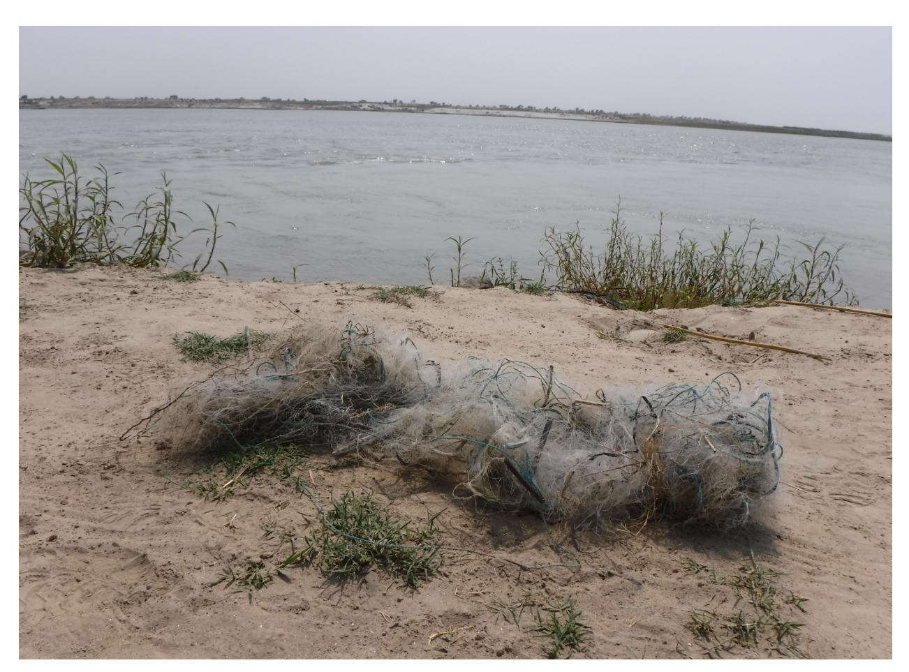
Figure 10. Discarded fishing gear on the banks of the Ganges River. Photo credit: Emily Duncan. Reproduced with permission.