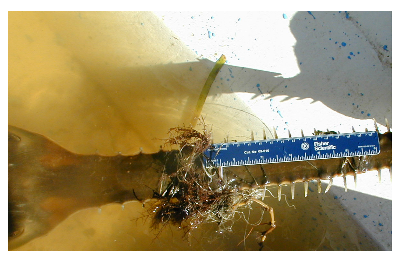
Figure 3. Smalltooth Sawfish entangled in fishing line.

clams to their natural predator, White Sturgeon. It was observed that feeding behaviour was altered in the sturgeon exposed to clams that had ingested microplastics, with exposed sturgeon ingesting more food overall. However, the effects seen were subtle, and it is not clear what the implications are for feeding and for ecosystem responses in the long term<sup>109</sup>. Asian Clams are a key food source for a range of Acipenser species and therefore it is a reasonable assumption that other species of sturgeon within the region of interest will also ingest microplastics through their prey, and may show similar responses.