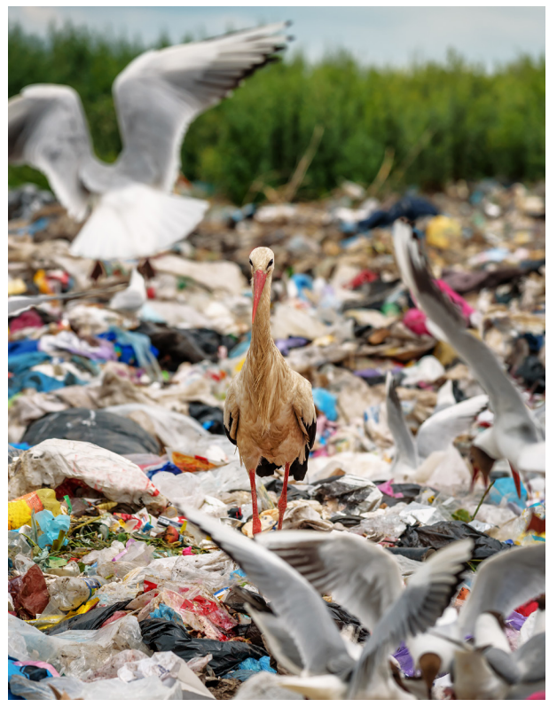
Figure 9. White Stork on a rubbish dump.

Black-footed Albatrosses (Phoebastria nigripes) and Laysan Albatrosses (Phoebastria immutabilis), both listed in CMS Appendix II, appear to be particularly vulnerable to plastic ingestion. This is likely due to their feeding strategy, selecting floating items from the ocean surface. In the time before the abundance of plastics, these items would have been dominated by organic matter and neustonic (floating) organisms. However, the growing prevalence of plastics in some areas means these can be difficult for albatrosses to distinguish, leading to accidental ingestion 160. These may then accumulate in the gut or be passed to offspring through regurgitates. Plastics from degraded postconsumer products have been observed in the digestive contents of albatross chicks in the Midway Atoll (North Pacific). In the study, Black-footed Albatrosses tended to ingest more fishing line, while Laysan Albatrosses ingested more fragments. A greater incidence of fishing line appeared to correlate with an abundance of fish eggs in their digestive contents<sup>161</sup>. This preference of Black-footed