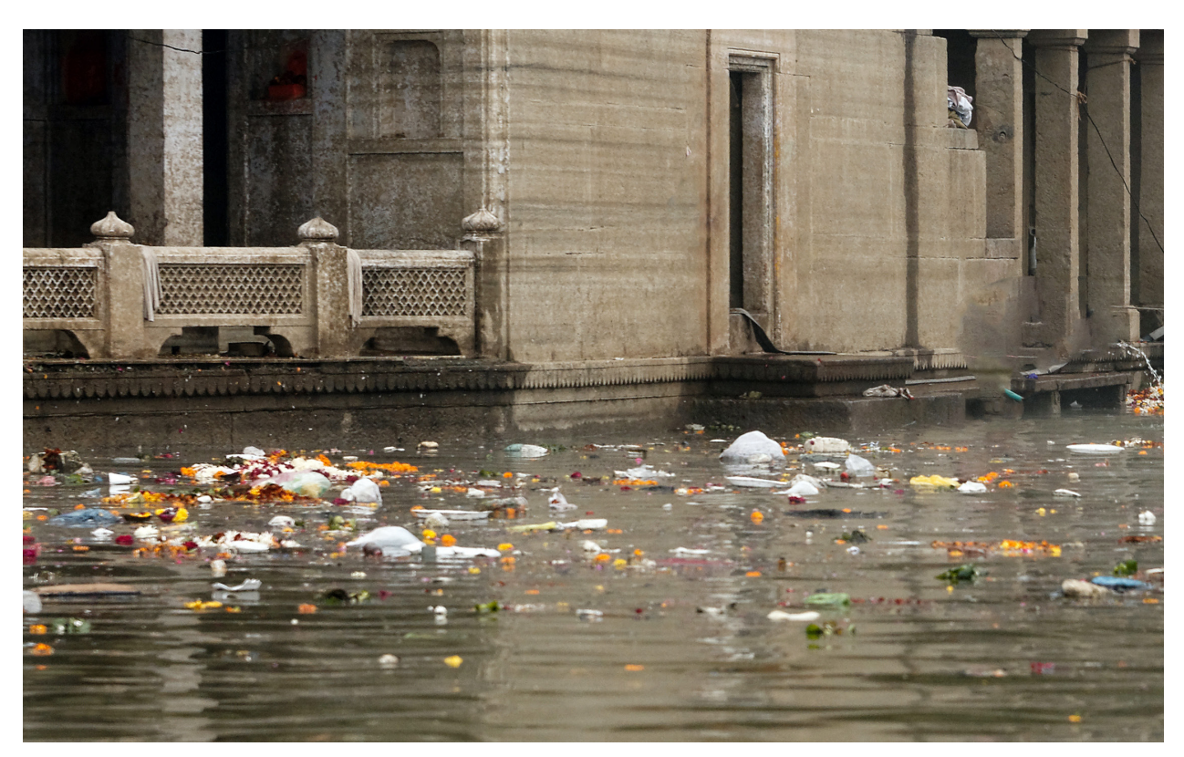
Figure 2. Litter floating in the Ganges River at Varanasi.

following the ban in 2002 which, in the first few years after the ban, was suggested to lead to reduced severity of flooding in the capital city Dhaka, due to reduced clogging of waterways with plastic litter<sup>87</sup>.