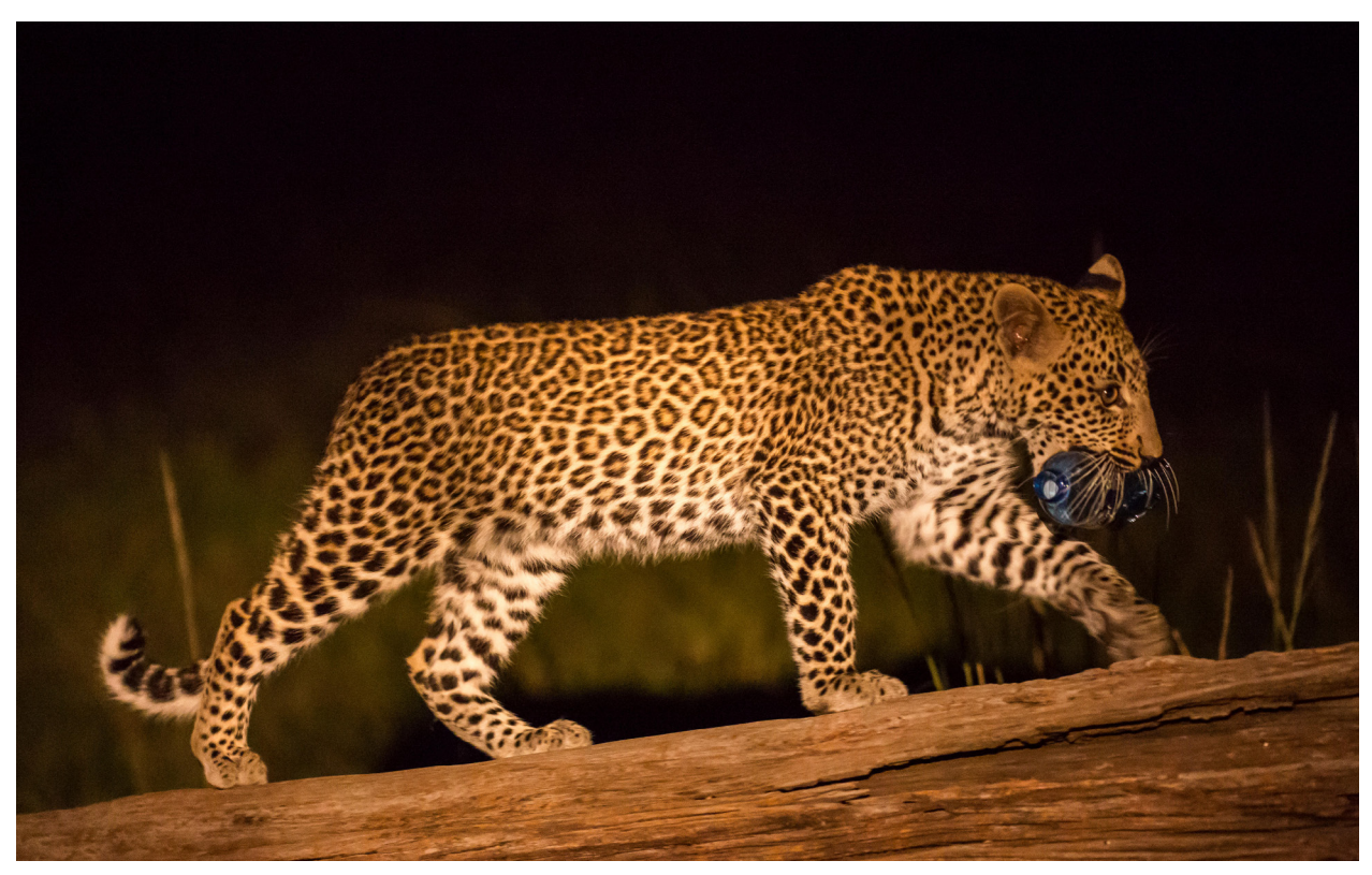
Figure 7. A leopard carrying a plastic bottle in its mouth, in the Masai-Mara game reserve, Kenya.