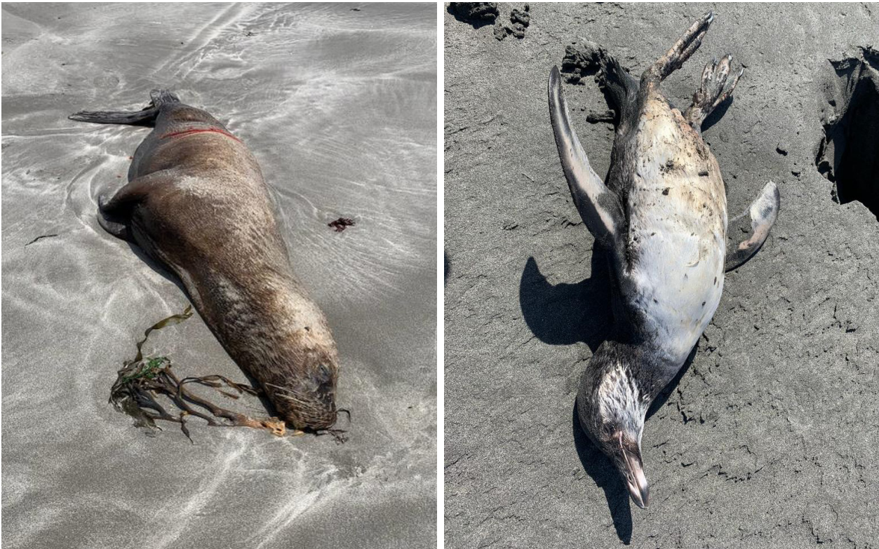
Figure 5. H5N1 is capable of infecting a wide range of scavenging and predatory mammals, including this South American Sea Lion, a victim of a large outbreak affecting the Peruvian and Chilean coast. As the disease spreads in South America, the range of species affected is increasing.