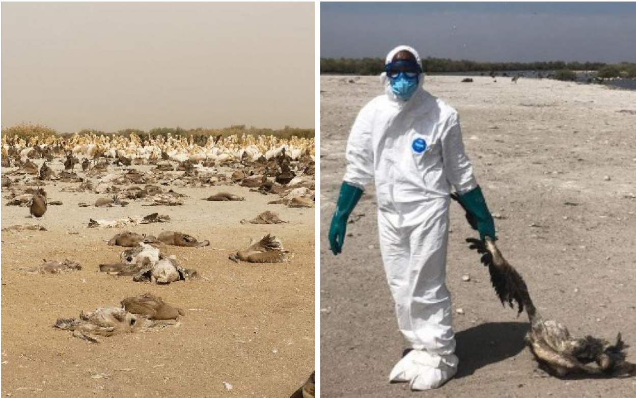
Figure 8. As this outbreak of HPAI in pelicans in Senegal shows, there are challenges in carcass removal but this can be undertaken safely if appropriate PPE is worn and carcasses are disposed of appropriately. Planning for such operations should be built into emergency response plans and developed in 'peacetime'.