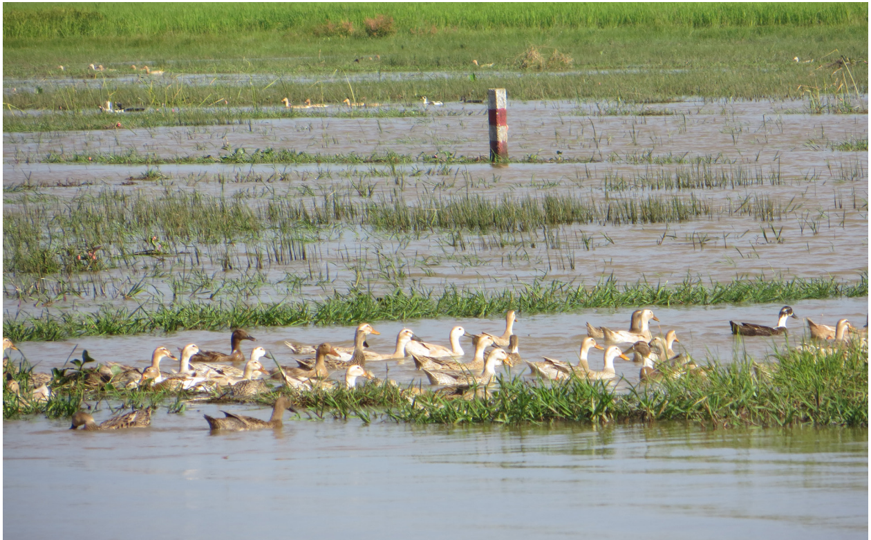
Figure 7. The increase in the practice of grazing domestic ducks in natural wetlands has created interfaces where virus exchange and re-assortment can occur easily. This creates risks to poultry and people as well as wildlife and from a health perspective is advised against.

Plans should, as a minimum, contain the following principles and practices set out below in Sections 2.3.1.1 – 2.3.1.13.