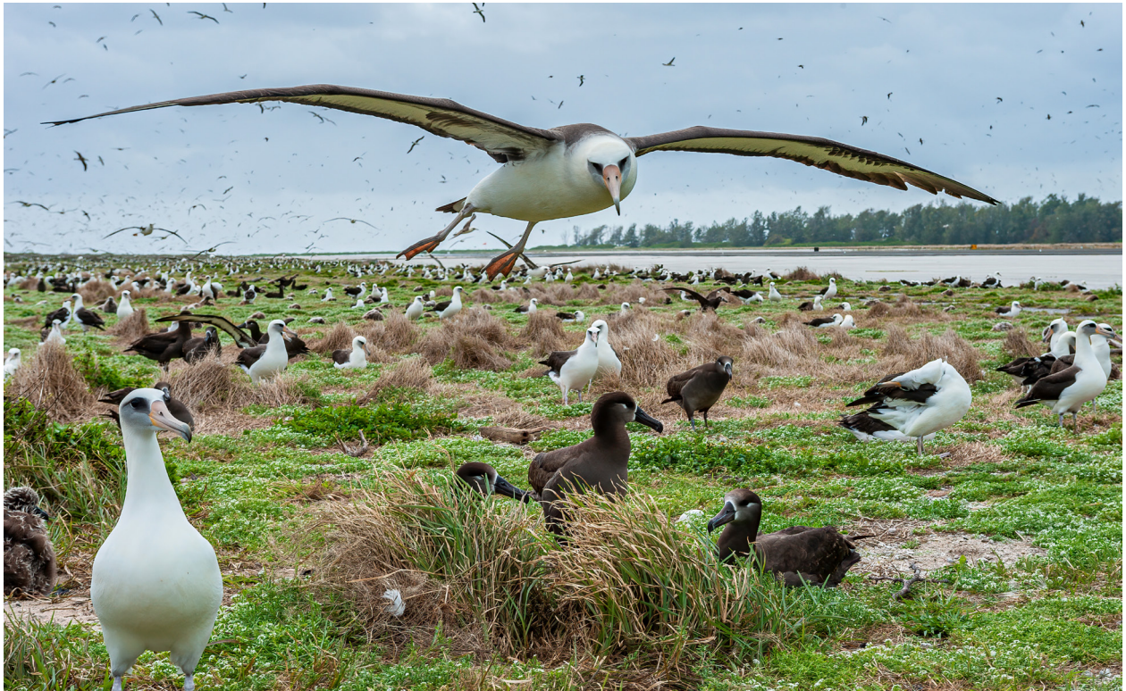
Figure 6. With H5N1 HPAI now capable of spreading in wild seabirds, remote oceanic islands, such as where these Laysan Albatross Phoebastria immutabilis breed, can no longer be considered safe from this virus which originated in poultry. There is growing concern about the possible impact of a highly pathogenic virus on such vulnerable populations as they are both already under significant pressures and rely on high annual adult survival.

decades along with increases in high-risk practices such as grazing of domestic ducks in natural wetlands. Further evolution and spread of avian influenza viruses can be expected in these situations (see Section 2.3.1.13).