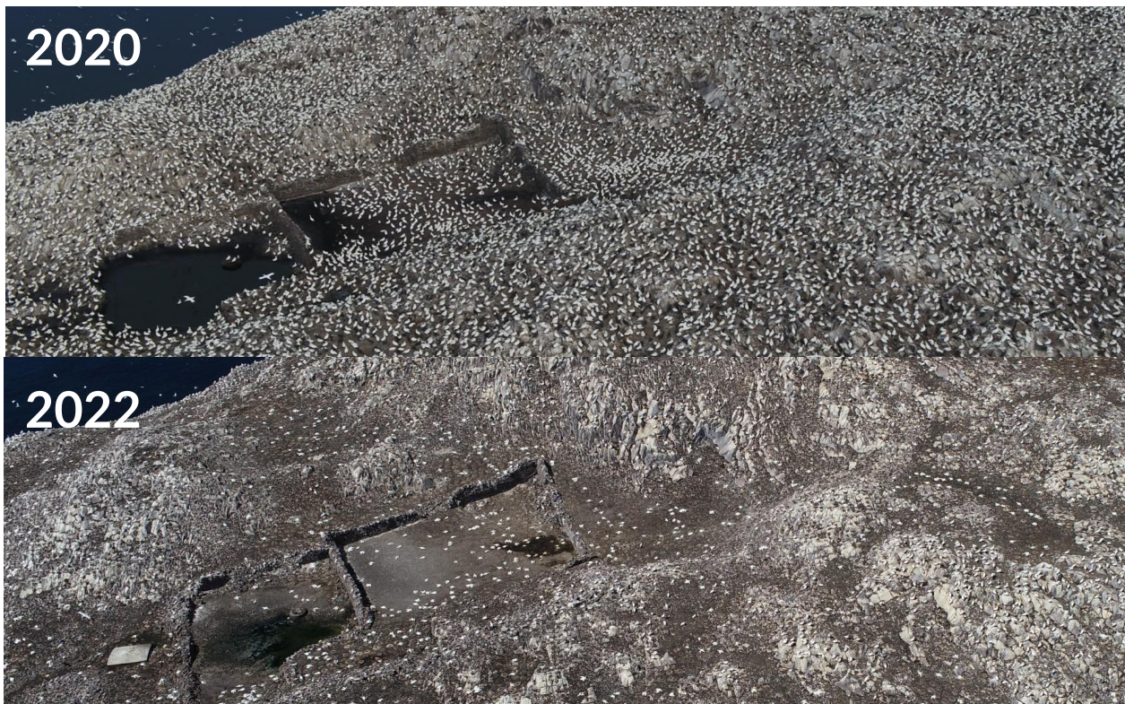
Figure 3. Before and after HPAI. A comparison of drone footage from 2020 and 2022 of the world's largest Northern Gannet breeding colony in Scotland, UK. In 2022, mass mortality of adults and young transformed the typically packed breeding sites.

of H5N1 HPAI, there has been a relatively small number of human H5N1 detections globally with 11 cases (not deaths) at time of writing reported since 2011 from China, Cambodia, Vietnam, India, UK, Spain, USA, Ecuador and Chile 4,33,34 . These cases (which include ~1 annual death in recent years) have been associated with close and/or repeated contact with infected domestic birds or heavily contaminated poultry environments 35 . Zoonotic risk from this virus is still considered low 4,36 . However, the ability of the virus to infect a variety of mammal species and detection, for example, in the farmed mink setting, where there is high potential for mammal-to-mammal transmission, has created public health concern 30,36 .