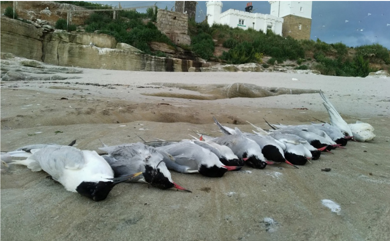
Figure 4. Previously rarely affected species that are not in typical contact with poultry, such as terns, have died in high numbers at breeding sites and throughout migratory flyways across the world.

species of cormorant and raptors including Secretarybird Sagittarius serpentarius and Barn Owl Tyto alba 60 .