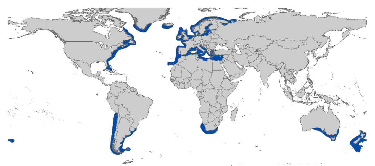
Figure 1: Distribution of Spiny Dogfish (Squalus acanthias)<sup>i</sup>.

Spiny Dogfish is distributed in both northern and southern temperate and boreal waters, but the species is listed on the MOU for the northern hemisphere populations only. Northern hemisphere subpopulations occur in the Northeastern and Northwestern Atlantic, Mediterranean Sea and Black Sea.