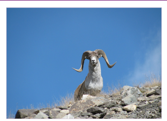
Argali Sheep