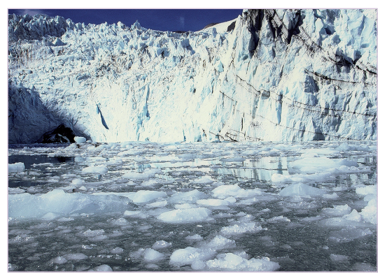
Glacier, Alaska

Our climate is changing and there is already compelling evidence that animals and plants have been affected. We conducted a literature review and consulted experts through a specially organised international workshop to identify the range of climate change impacts and to consider how migrant populations could be affected by these changes. The primary instrument for migratory species conservation is the Convention on Migratory Species and its daughter agreements. Several other international policy instruments cover some migratory species, but only the Ramsar Convention on wetlands explicitly mentions climate change.