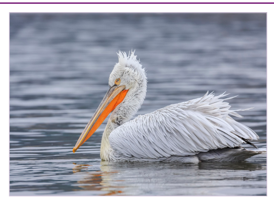
Dalmatian Pelican

CMS Parties at COP12 decided through Resolution 12.28 to merge Concerted Actions (previously focusing on Appendix I species) and Cooperative Actions (previously focusing on Appendix II species) and retain the name Concerted Action. Concerted Actions involve measures that are the collective responsibility of Parties acting in concert or are designed to support the conclusion of an instrument under Article IV of the Convention and enable conservation measures to be progressed in the meantime or represent an alternative to such an instrument.