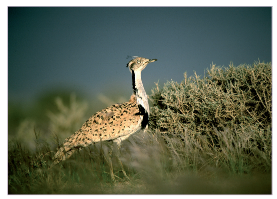
Houbara bustard

Species designated for Concerted Actions 2012-2014 in 2011 (Resolution 10.23). Those species marked with an asterix * were added at COP11 through Resolution 11.13.