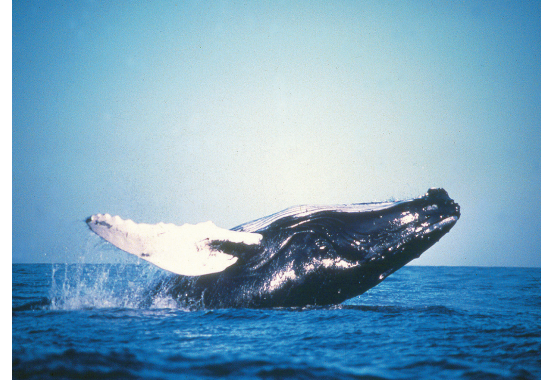
Humpback whale

Whales, dolphins and porpoises (cetaceans) are one of the key taxonomic groups for CMS. There are two Agreements in force dealing exclusively with cetaceans—ASCOBANS (dealing with small cetaceans in the North Sea, Irish Sea, North-East Atlantic and Baltic Sea) and ACCOBAMS (all cetaceans in the Mediterranean and Black Seas). In addition to these Agreements, there are two Memoranda of Understanding for the conservation of cetaceans in the Pacific Islands Region and for cetaceans and manatees of the Eastern Atlantic basin off Africa.