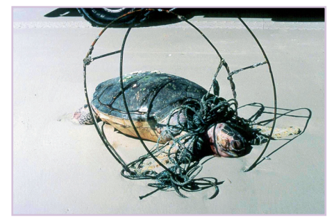
Turtle in crab pot

The Sixth Conference of the Parties was the first to discuss the problem of by-catch, recognizing that it was a worldwide issue with an impact on many migratory taxa and had to be addressed by CMS in conjunction with fisheries management organizations and other conventions dealing with biodiversity and the marine environment.