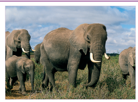
African Elephant

These are the species designated for Cooperative Action by COP10 (those species marked with an asterisk * were added at COP11 through Resolution 11.13 and the species marked + was excluded)