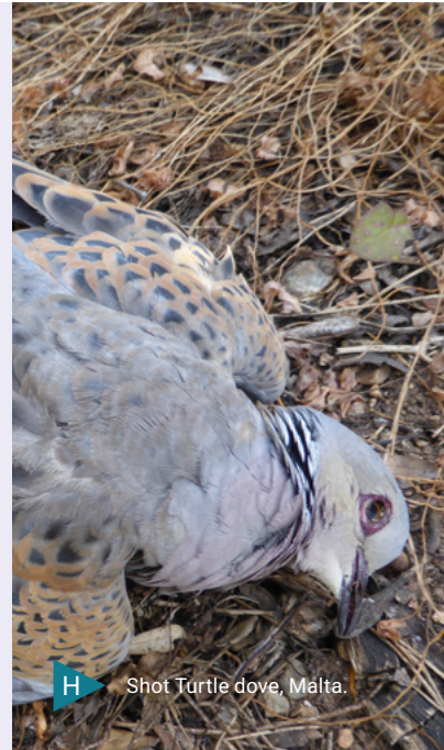
H Shot Turtle dove, Malta.

In parallel, ‘Unsustainable hunting pressure on turtle doves’ the quantities of birds hunted legally, has been methodically addressed at EU level with some notable successes in the Western Flyway.