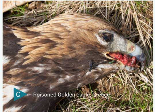
C Poisoned Golden eagle, Greece

A large number of different traps are used across the Mediterranean for catching birds. Snap traps are baited and snap shut when a bird steps on them, killing it. Stone traps use a large slab of stone supported by sticks that drops when the bird steps on them, crushing the bird.