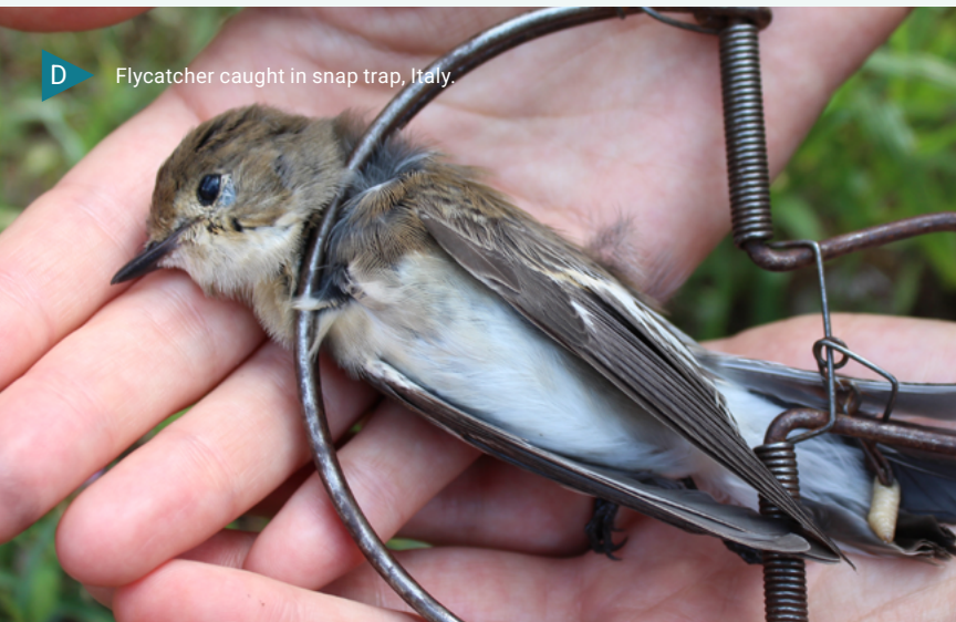
D Flycatcher caught in snap trap, Italy

This involves taking young birds directly from their nests so they can be raised in captivity. Trappers will usually target chicks, and it is mostly used for raptors and finches.