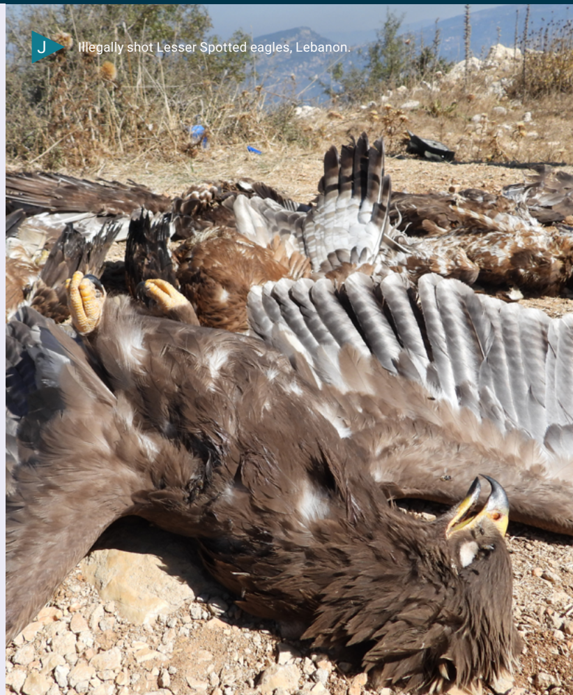
Illegally shot Lesser Spotted eagles, Lebanon.

The Lesser Spotted eagle 8 breeds in the northern hemisphere and migrates to eastern Africa, depending on thermals over dry land. Protected by several international agreements, it faces major threats from illegal shooting along its migration route over the Middle Eastern Mediterranean coast, especially in Egypt, Lebanon, and Türkiye. With 46,800–63,300 mature individuals globally, up to 7% may be shot each year crossing the Mediterranean 9 , compounding risks from habitat loss and other human activities. Improved enforcement and surveillance are crucial in Egypt, Syria, Lebanon, and Türkiye to ensure safe migration.