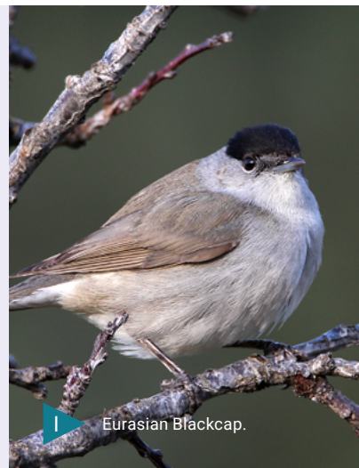
I Eurasian Blackcap.

The European Goldfinch 7 ( Carduelis carduelis ) is a popular cagebird in the Mediterranean, often trapped or bred from stolen chicks for sale. High demand in the Maghreb, especially Morocco, Algeria, and Tunisia, has led to a 56% range reduction in North Africa, mainly in Algeria.