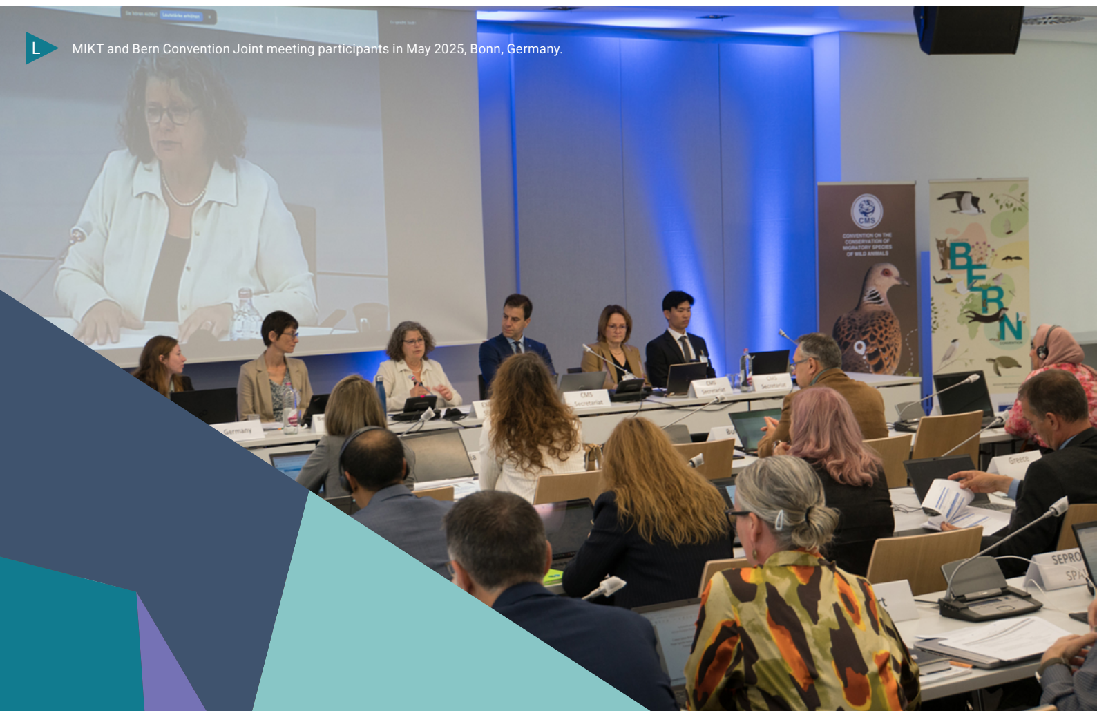
MIKT and Bern Convention Joint meeting participants in May 2025, Bonn, Germany.

The Convention on Migratory Species adopted in 2014 Resolution 11.16 (Rev. COP14) on The Prevention of Illegal Killing, Taking and Trade of Migratory Birds . Based on the mandate of this Resolution, the CMS Secretariat convened the Intergovernmental Task Force on Illegal Killing, Taking and Trade of Migratory Birds in the Mediterranean in 2016, the Asia Pacific Illegal Taking of Migratory Birds Intergovernmental Task Force (ITTEA) in 2023, and the Task Force for Illegal Taking of Migratory Birds in South-West Asia in 2025.