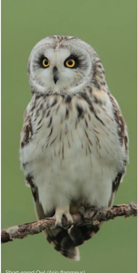
Short-eared Owl (Asio flammeus)

The Coordinating Unit strives to facilitate and support Signatory States to communicate, collaborate and coordinate a full range of conservation actions to increase the effectiveness of the Raptors MoU. Working together to develop international partnerships is necessary to tackle the many threats that face migratory birds of prey, and also delivers wider conservation benefits to other species of wildlife and biodiversity.