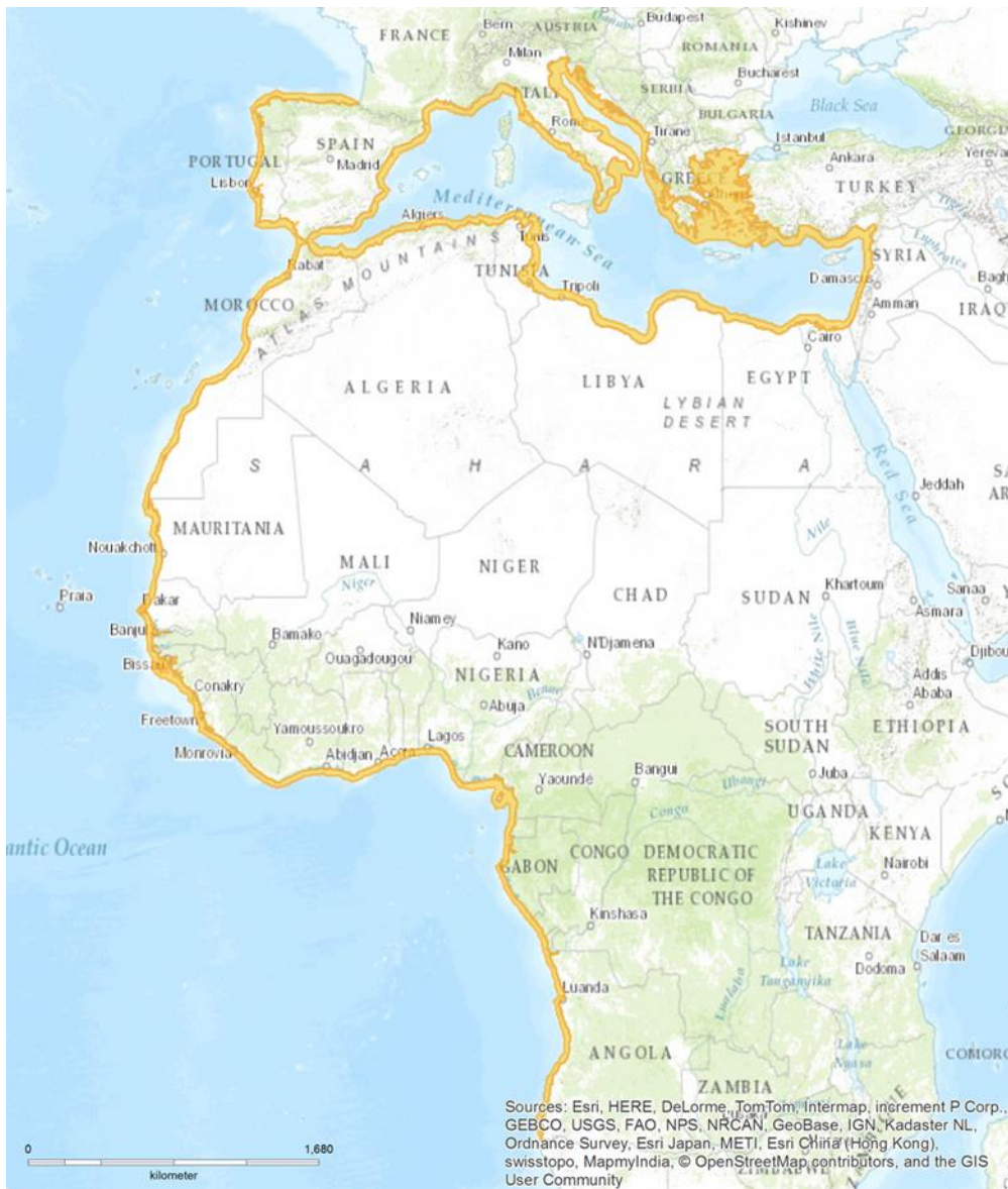
Figure 1: Common Guitarfish ( Rhinochimaera rhinobatos ) geographical range ( https://www.iucnredlist.org/species/63131/12620901 )