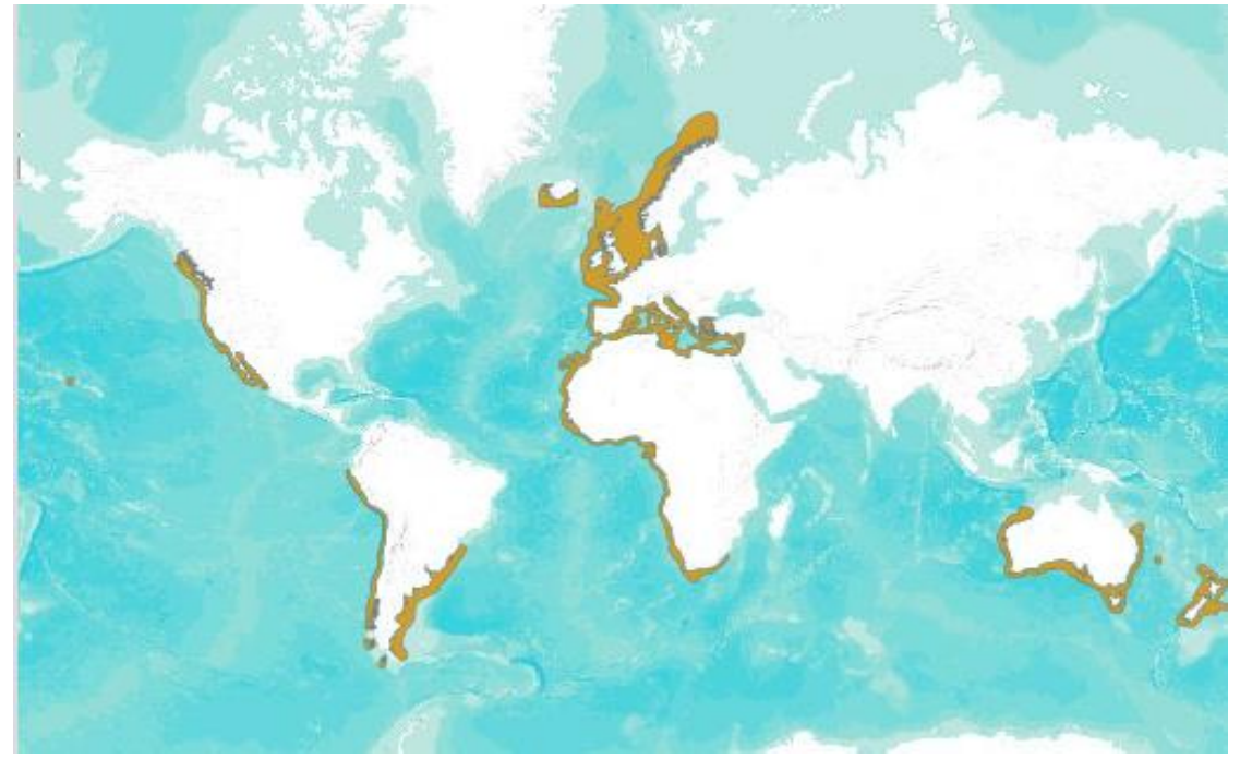
Figure 2: Tope ( Galeorhinus galeus ) distribution. International Union for Conservation of Nature (IUCN) 2012. The IUCN Red List of Threatened Species. Version 2018-2.

G. galeus have a widespread, cosmopolitan, benthopelagic coastal and offshore distribution in temperate waters (Compagno, 1984). The specific distribution of tope covers the following regions: Western Atlantic: southern Brazil to Argentina. Eastern Atlantic: Iceland, Norway, Faeroe Islands, British Isles to the Mediterranean and Senegal; Gabon to South Africa and Mozambique (Western Indian Ocean). Western Pacific: Australia and New Zealand. Eastern Pacific: British Columbia (Canada) to southern Baja California, Gulf of California; Peru and Chile (Compagno, 1984; Walker et al., 2006). Tope are absent from eastern North America and eastern Asia (Castro, 2011) (Figure 2).