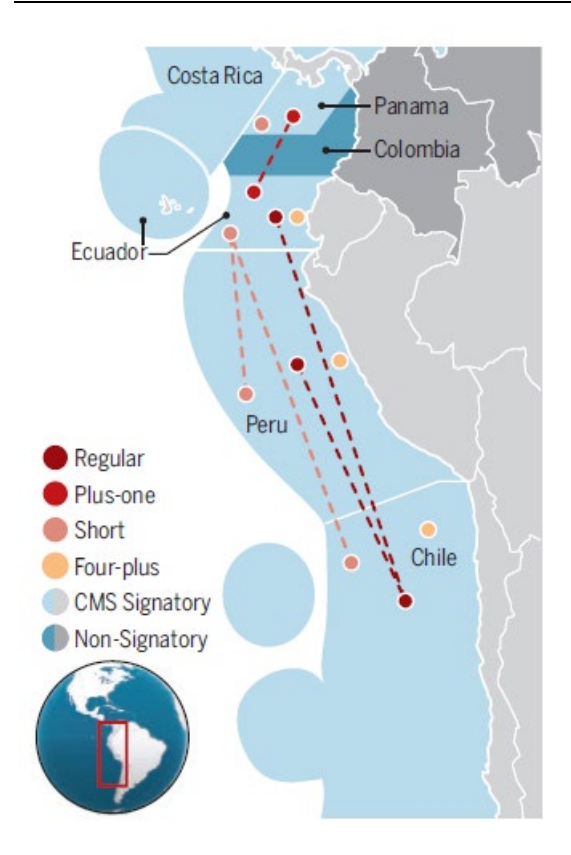
Figure 1. Sperm Whale vocal clans of the eastern tropical Pacific (extracted from Brakes et al. 2019)