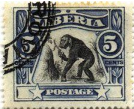
Figure 2. Liberia postage stamp, 1906, illustrating chimpanzee tool use.

Routes for this will be explored at the initial meeting outlined above. Conventional opportunities are provided by newsprint, TV and online, noting that although computers and tablets may be relatively rare especially in rural contexts, mobile phones with internet access are becoming much more common. Less conventional possibilities to be explored include a form of 'citizen science' along the lines of such activities as 'the big butterfly watch' in the United Kingdom, in which the public input their local discoveries to a central database. Yet more imaginatively, we may recall that in 1906 Liberia printed a stamp celebrating tool use by Chimpanzees (Figure 2); perhaps an equivalent stamp or even currency note portraying nut-cracking could be encouraged, taking different but related formats as a Concerted Action across range states to celebrate this unique cultural and scientific heritage.