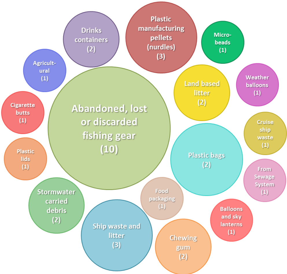
Figure 2: Targeted campaigns in the case studies by debris type

No specific debris types have been identified as gaps in campaigning, although changes in product design, packaging and the use of new materials mean that campaign organisations must react quickly if they are to keep pace with new types of marine debris.