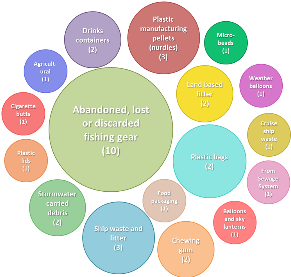
Figure 2: Targeted campaigns in the case studies by debris type

No specific debris types have been identified as gaps in campaigning, although changes in product design, packaging and the use of new materials mean that campaign organisations must react quickly if they are to keep pace with new types of marine debris.