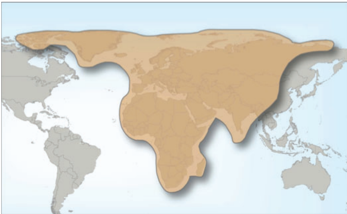
Figure 1. African-Eurasian flyway.

The crosswalk table will assist the AFEU Flyway Committee and the AMBI Steering Group to maximize their efforts, by adding value to on-going activities and existing management frameworks and/or in filling conservation gaps. It will further identify potential cooperation across development initiatives that will assist sustainable development to benefit Arctic species. The crosswalk compares AMBI actions, existing relevant international agreements and frameworks and national commitments.