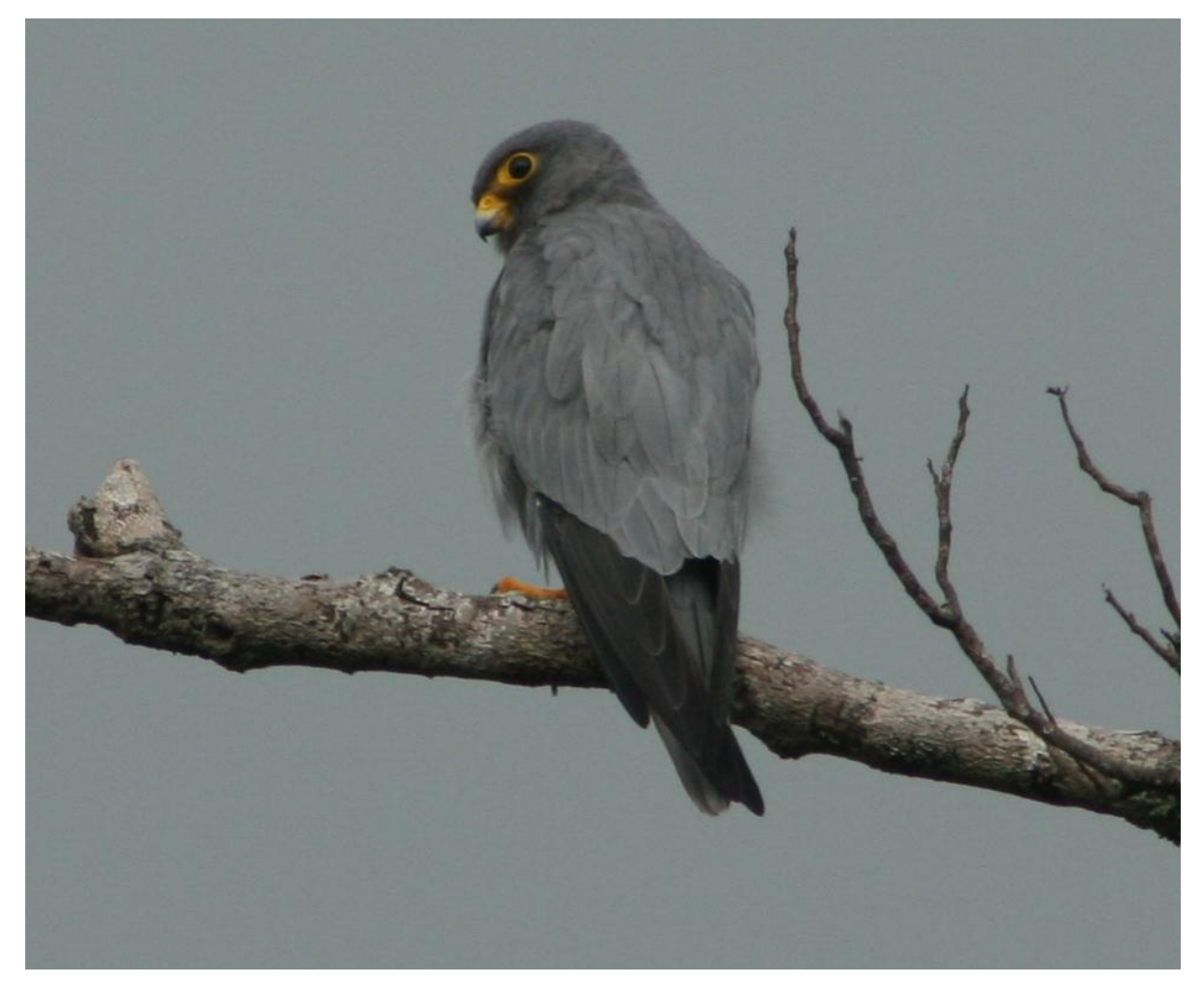
Adult Sooty Falcon

• The conservation of these species must consider the integration of all stakeholders as a main priority and strengthen cooperation with different sectors in the implementation of the current action plan.