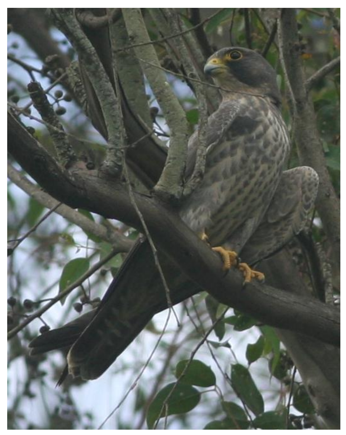
Juvenile of a Falco concolor