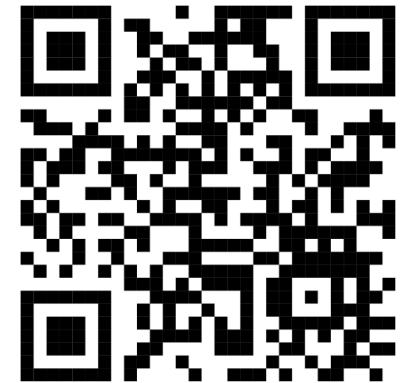
Killing 3.0 report