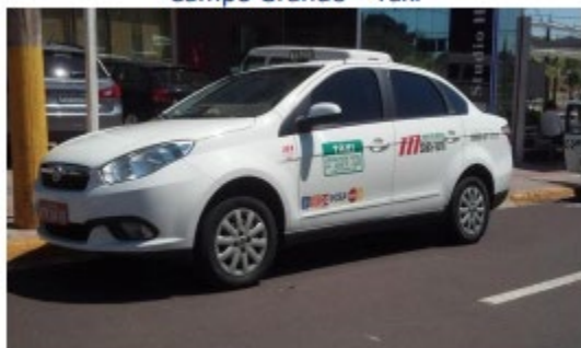
Campo Grande – Taxi