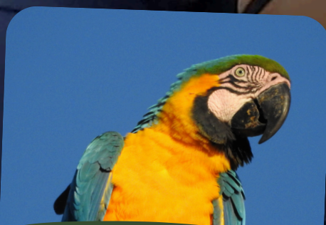
Blue-and-yellow Macaw ( Ara ararauna )