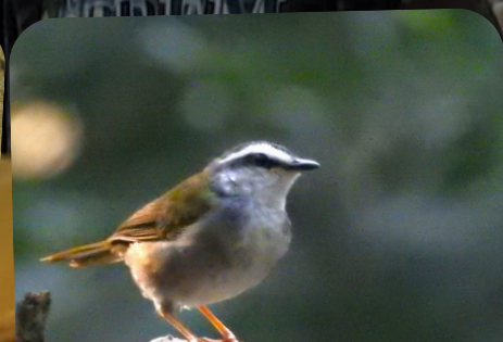
White-striped Warbler ( Myiothlypis leucophrys )