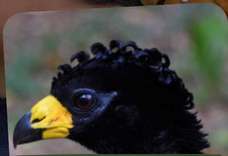
Bare-faced Curassow ( Crax fasciolata )

MORE THAN 400 SPECIES IN CAMPO GRANDE ON WIKIAVES