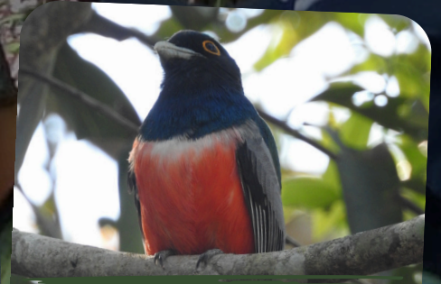
Blue-crowned Trogon ( Trogon curucui )