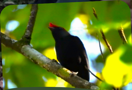
Helmeted Manakin ( Antilophia galeata )