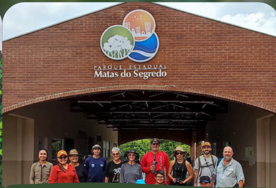
PARQUE ESTADUAL MATAS DO SEGREDO