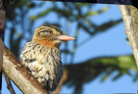
Chaco Puffbird ( Nystalus striatipectus )