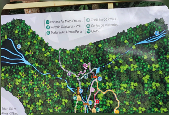
PARQUE ESTADUAL DO PROSA