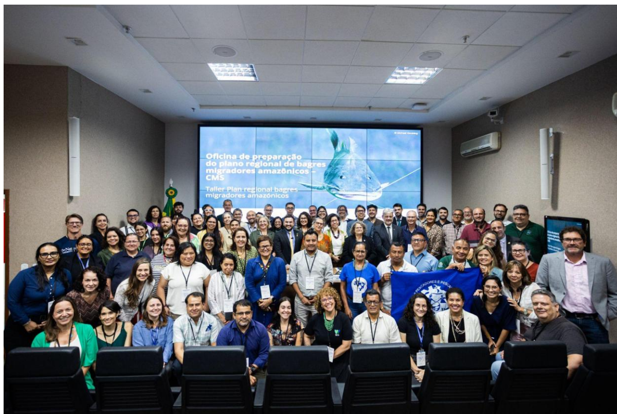
Figure 1. Regional workshop for the preparation of the Action Plan. Brasilia, 2025