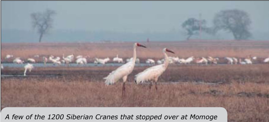
A few of the 1200 Siberian Cranes that stopped over at Momoge National Nature Reserve, China, in November 2007.

a few individuals of the central/western populations continue to be reported in Kazakhstan and Russia during migration, but only a single male was recorded at a known wintering site in Iran in 2007. Although only a very few may still survive, hope remains. The eastern population wintering in China at Poyang Lake has been reported as more than 3500 birds, but their numbers may be due to a concentration of birds as other winter habitat is lost. The plight of this extraordinary species has inspired many people to protect them and their wetland homes, but the challenge is great. The future of this great white crane depends on coordinated action all along their flyways.