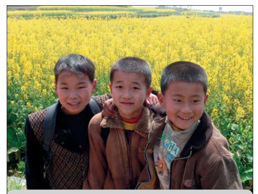
Children at Chian Village, a community pilot project site supporting a county nature reserve at Poyang Lake, China.

Future work will be carried on by government managers, by better trained reserve staff, by NGOs and by local communities—leaders, teachers and students—who have become