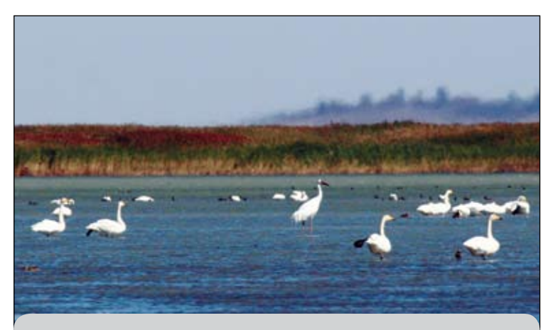
Siberian Crane with Whooper Swans and ducks at Naurzum Lake system, Kazakhstan, during autumn migration 2006.

Siberian Cranes are critically endangered as a result of hunting and habitat loss. The last known pair of the central population wintered in India in 2001/02. Unconfirmed sightings of