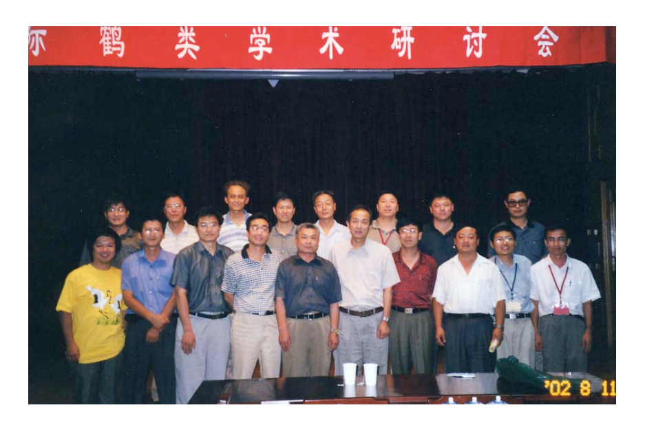
Meeting of the representatives from Crane Network Sites in China