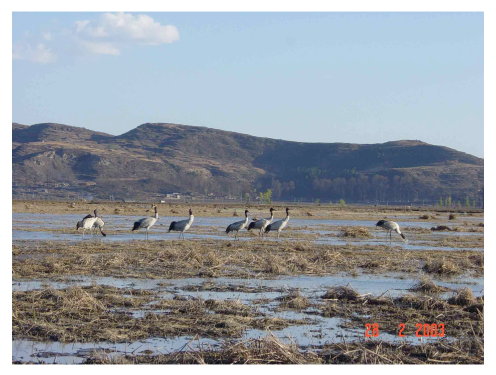
Cao Hai National Nature Reserve, Guizhou Province