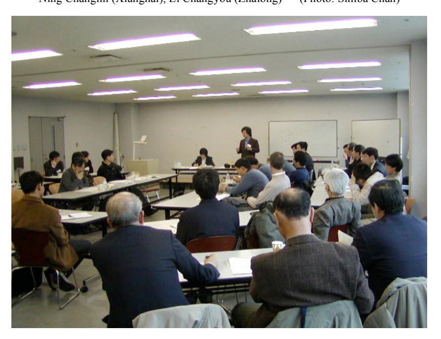
Workshop at Kushiro. March 2002.