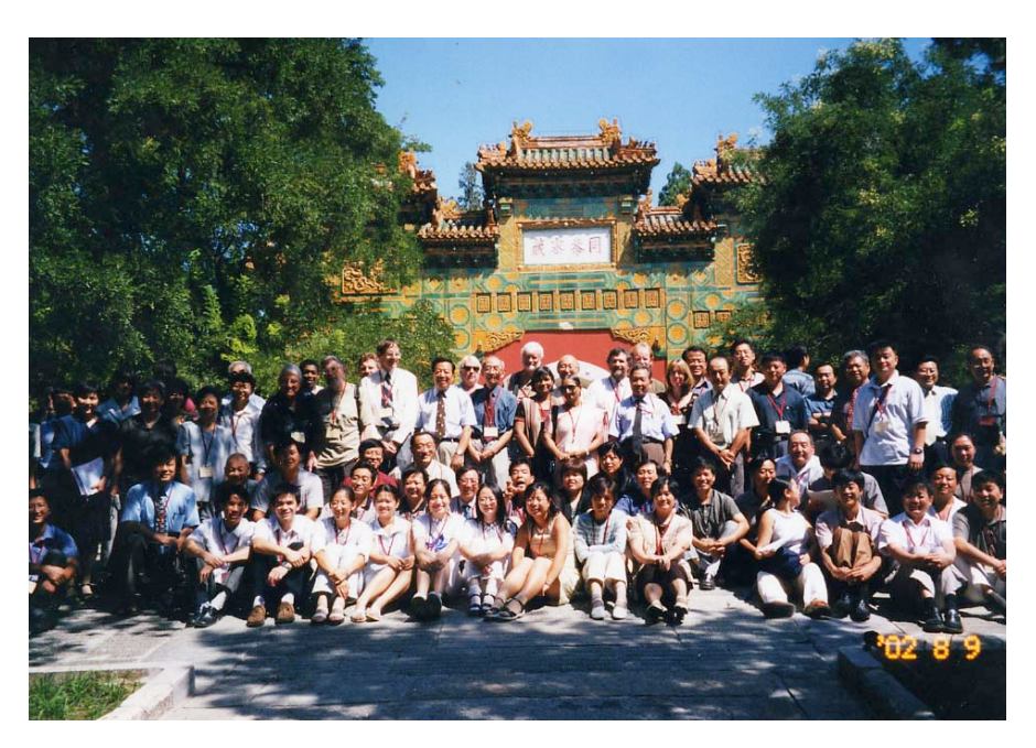
Workshop participants at Wofosi

The workshop was organized jointly by the International Crane Foundation and the Chinese Ornithological Society.