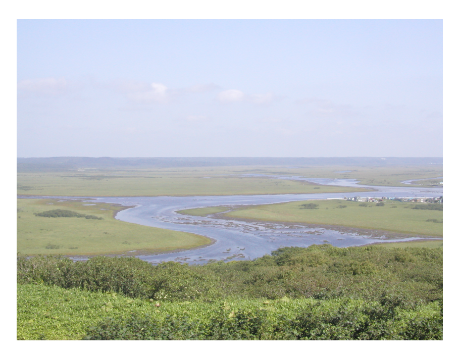
Kiritappu wetland

is secured because of the cooperation of the land owners. However, as the land owners are aging and some have since moved out of the district, to place the area under public protection is more desirable. In April 2000, the Kiritappu-shitsugen Fan Club, an organization formed for the long-term conservation of the wetland habitat, became the Kiritappu Wetland Trust, a registered Non-profit Organization. It is now actively working on purchasing the privately owned land inside the Kiritappu wetland.