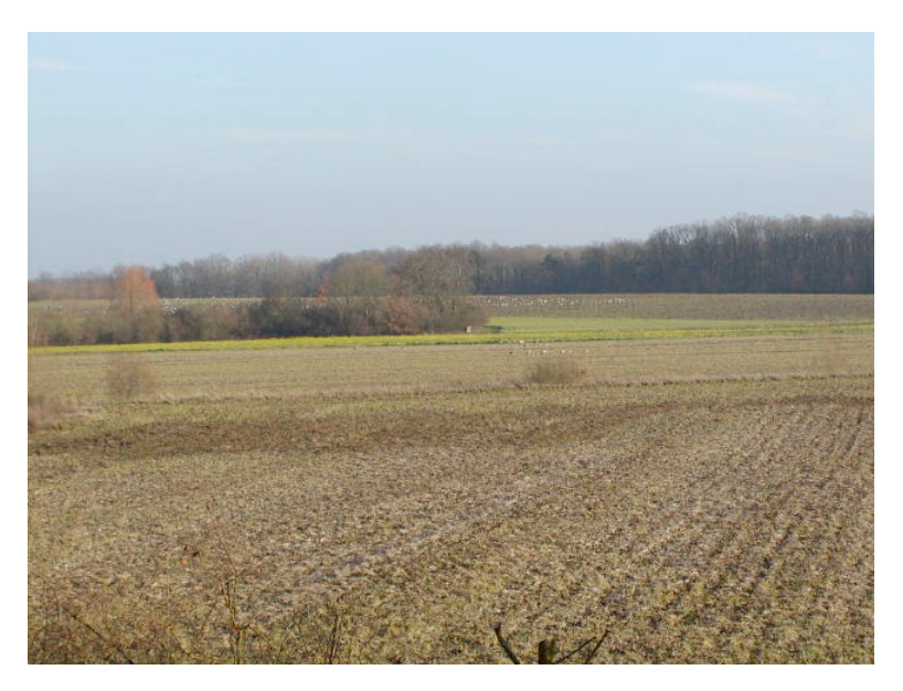
La Ferme aux Grues. November 2002

Champagne-Ardenne, which is about 100km east of Paris, easily reached by train or car in about 2 hours from Paris. The area where you can find cranes is about 2,800 sq. km (radius of about 30 km from the main roost of Lac du Der-Chantecoq). Two sites were visited: