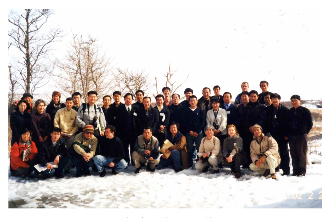
Education workshop at Kushiro February 2002

The Newsletter of the North East Asian Crane Site Network