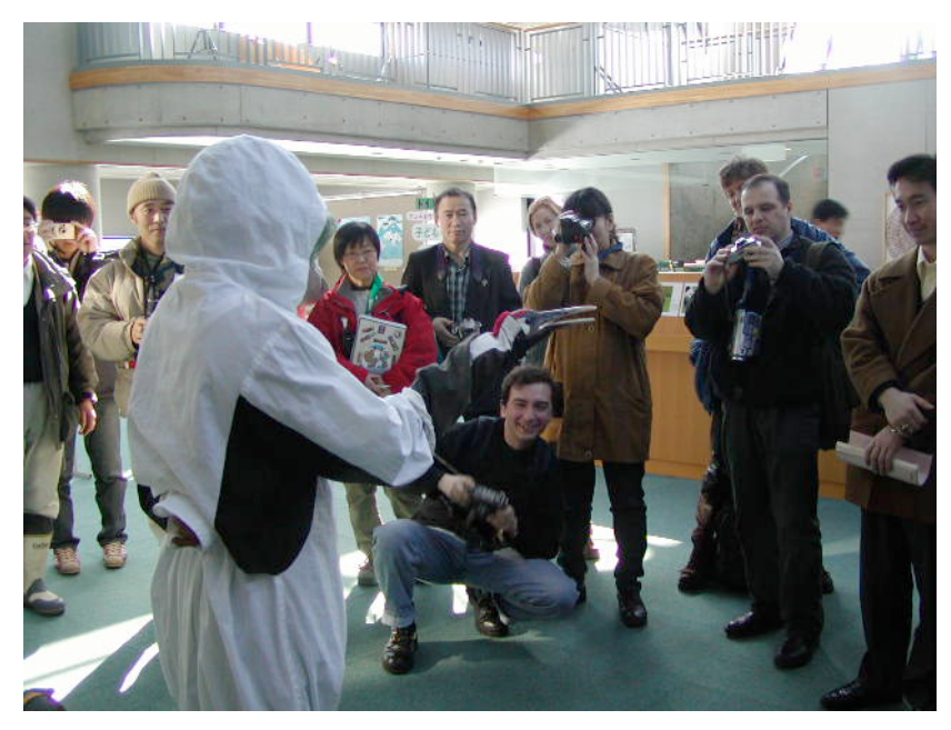
Participants at the Akan International Crane Center. February 2002

The workshop summarized results of the discussion since the previous workshop. Materials were collected for a handbook on education and visitor management. This will be published in 2003.