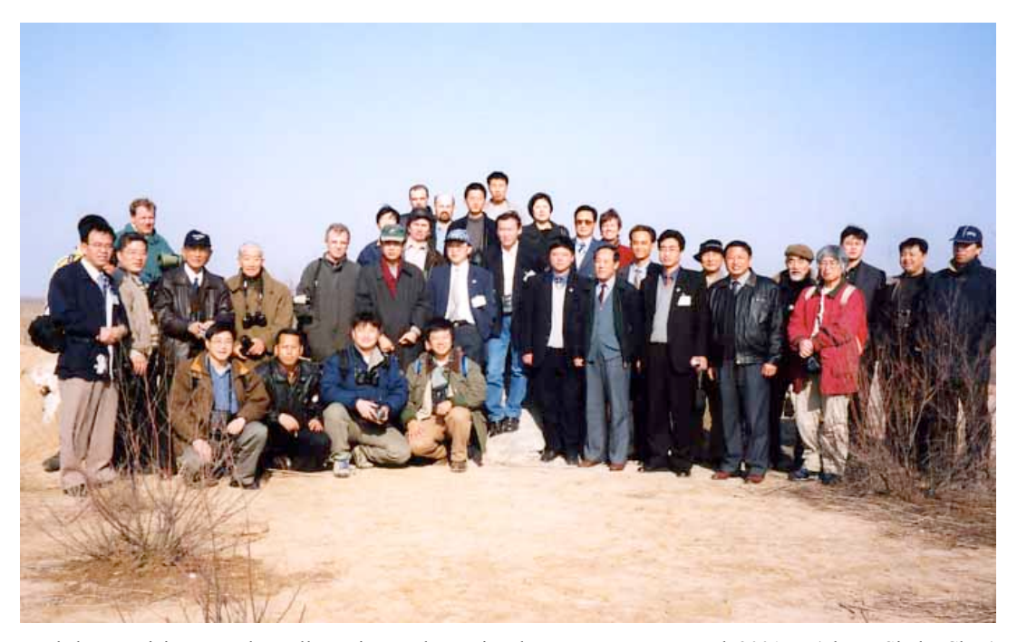
Workshop participants at the Yellow River Delta National Nature Reserve. March 2001

The second workshop was convened in Kushiro, Japan. 27 February – 2 March 2002.