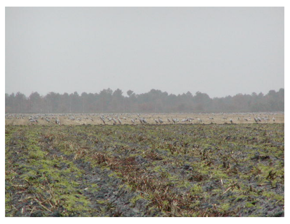
Wintering cranes in Bordeaux. December 2002

This is the major wintering ground of cranes in France. In recent years 25,000 - 50,000 cranes winter in the area annually. The change of number is related to the change in water level of the lakes. When the area was visited on 27 November 2002, at least 2,500 cranes were counted in one single maize field. There are about 10 roosts of cranes in the area, the biggest two are found inside the military zone.