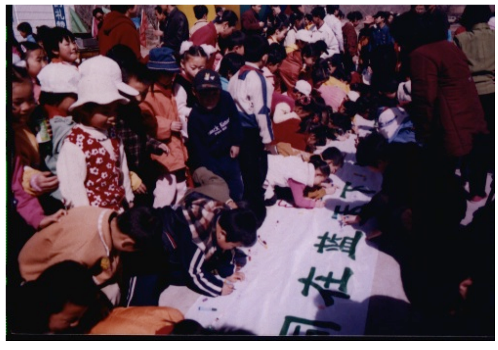
Education activity at Xianghai National Nature Reserve, Jilin Province