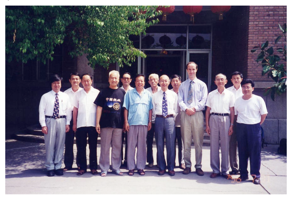
The Chinese National RDB Workshop in Hohhot, July 1996

Cranes and storks are relatively well-studied birds so the species accounts are quite long. The species covered under the North East Asian Crane Site Network are listed below with the numbers of pages of the accounts and their IUCN global conservation status (identical to the status listed on the Red Data Book):