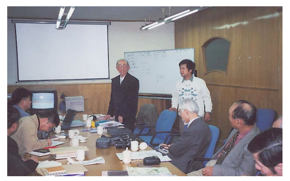
Workshop in Beijing. March 2001

In March 2002, a meeting was held in Inchoen, Republic of Korea to discuss possibilities of establishing new wintering sites on the Korean peninsula. Site surveys had been conducted by scientists from Japan and Korea to collect baseline information of potential sites.