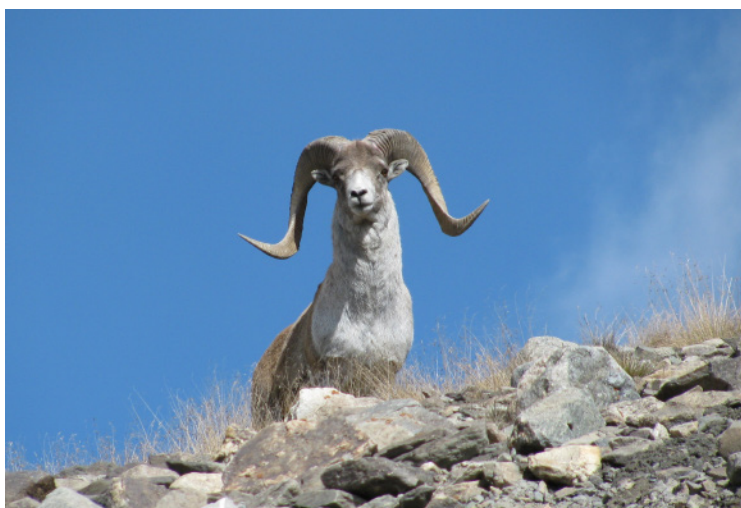
Argali sheep