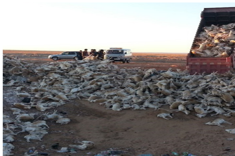
Mass mortality of Mongolian gazelles

This was announced by the leading scientist of the Institute of Biology, Mongolian Academy of Sciences, Dr. Lkhagvasuren Badamjav at the meeting of the Sessional Committee of the Scientific Council of the CMS, taking place on April 18-22 in Bonn, Germany. More than 5,300 Mongolian gazelles died in winter 2016, unable to cross the Trans-Mongolian Railway in Mongolia. The mass die off was the result of a combination of factors. Drought followed by heavy snow and extreme temperatures of -40 degrees Celsius as well as the barrier in the form of the Trans-Mongolian Railway, fenced with barbed wire on both sides triggered this mass mortality. The CMS Scientific