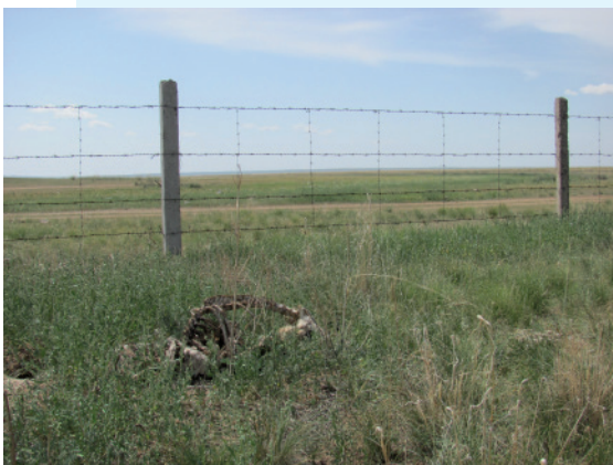
Dead Mongolian gazelle