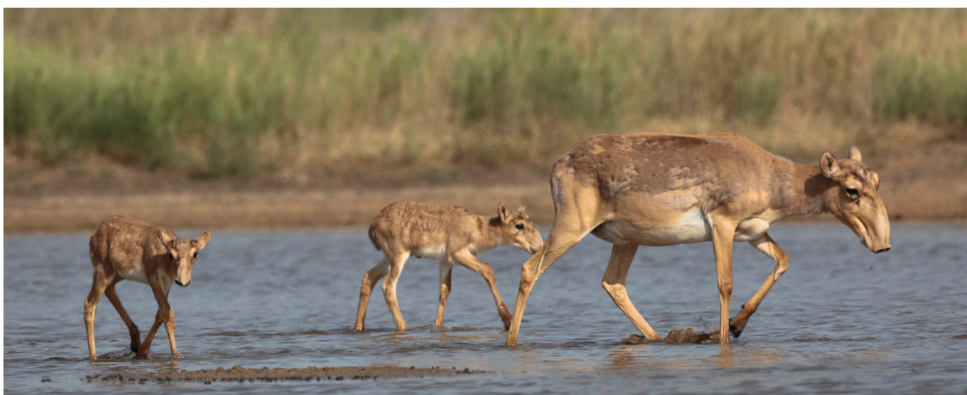
Saiga Antelopes

IUCN World Conservation Congress Hawai'i 2016