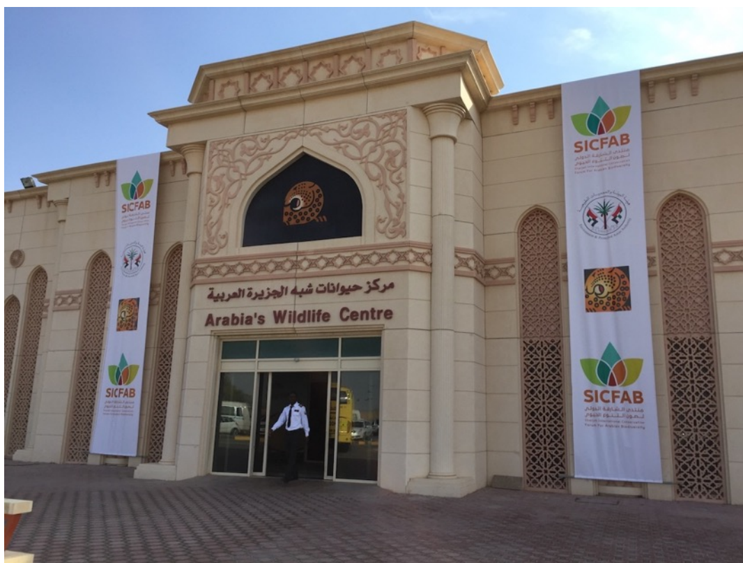
PHOTO 1: WORKSHOP VENUE - ARABIA'S WILDLIFE CENTRE, SHARJAH EMIRATE, UAE

THE WORKSHOP TOOK PLACE AT ARABIA'S WILDLIFE CENTRE, SHARJAH – UAE. SEE PHOTO 1