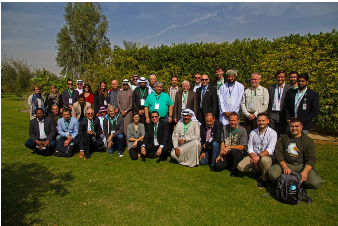
PHOTO 3: GROUP PHOTO OF THE PARTICIPANTS OF THE MIDDLE EAST REGIONAL WORKSHOP OF THE VULTURE MSAP

AT THE END OF THE DAY, ALL PARTICIPANTS OF SICFAB 2017 GATHERED IN PLENARY AND EACH WORKSHOP GROUP PRESENTED THE OUTCOME OF THE DAY'S DELIBERATIONS. THE PRESENTATION THE VULTURE MSAP GROUP IS AVAILABLE AS ANNEX IX.