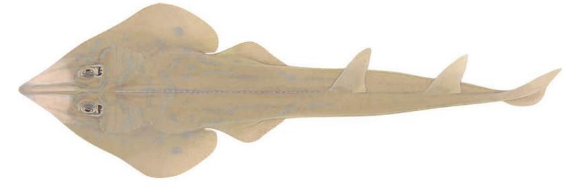
Figure 1. Rhinobatos rhinobatos; illustration from Last et al. (2016).