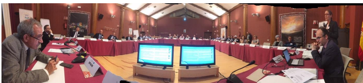
Panoramic view of the workshop session, Day 1: 09 May 2018