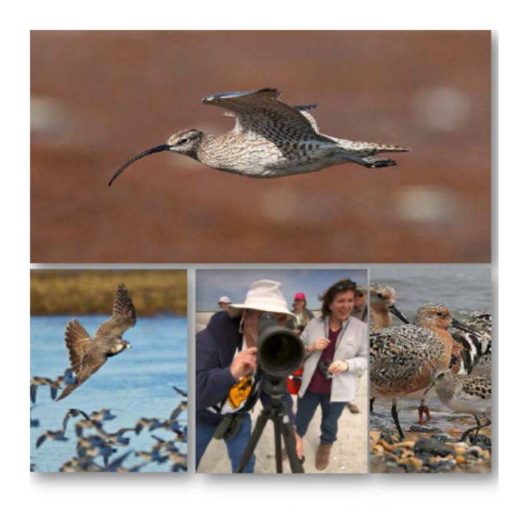
Atlantic Flyway Shorebird Initiative A Business Plan 28 February 2015