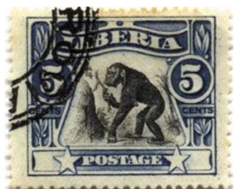
Figure 2. Liberia postage stamp, 1906, illustrating chimpanzee tool use.

Routes for this will be explored at the initial meeting outlined above. Conventional opportunities are provided by newsprint, TV and online, noting that although computers and tablets may be relatively rare especially in rural contexts, mobile phones with internet access are becoming much more common. Less conventional possibilities to be explored include a form of 'citizen science' along the lines of such activities as 'the big butterfly watch' in the UK, in which the public input their local discoveries to a central database. Yet more imaginatively, we may recall that in 1906 Liberia printed a stamp celebrating chimpanzee tool use (Figure 2); perhaps an equivalent stamp or even currency note portraying nut-cracking could be encouraged, taking different but related formats as a Concerted Action across range states to celebrate this unique cultural and scientific heritage.