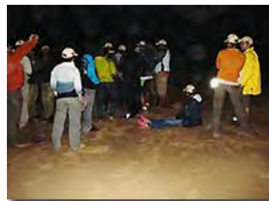
Figure 2: IOSEA Training Participants on one of the patrol cars and on the last stretch of the 10 km patrol.