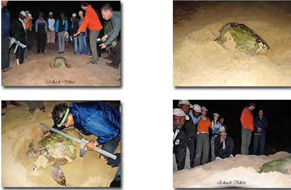
Figure 3: Caretta caretta nesting.

During the first on foot patrol only a loggerhead track was identified but no nest was laid. With this track it gave the opportunity to explain to participants how to clearly identify a loggerhead turtle track and the differences found between species. On the way back to camp, a nesting loggerhead was identified and Dr. Mark Hamman explained the basic nesting female biology and ecology while Mr. Pierre Lombard showed the basic monitoring procedures (Figure 3).