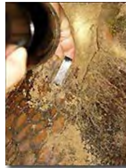
Figure 5: Dermochelys coriacea track and a tagged Caretta caretta (MZ245).