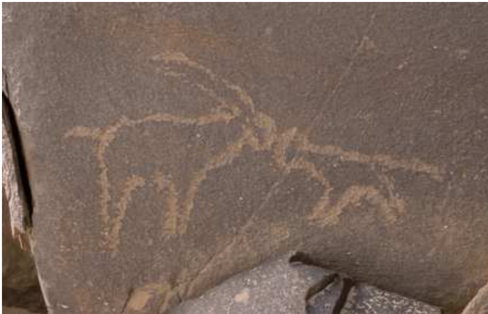
Oryx dammah. Engraving. Niger