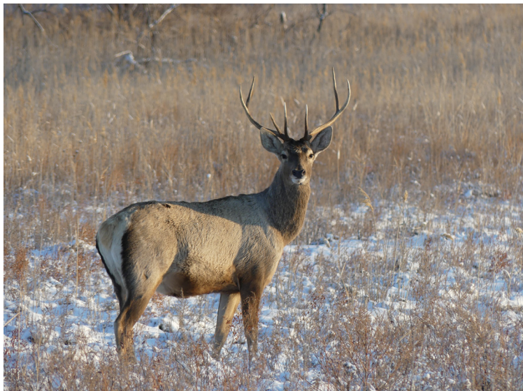
Bukhara Deer in Ile Balkhash, Kazakhstan

Government representatives, NGOs and experts agreed on a new five-year work programme for the conservation of the Bukhara Deer ( Cervus elaphus bactrianus ). The work programme as well as a comprehensive overview report on the conservation status of the species was reviewed during a technical workshop under the CMS Memorandum of Understanding concerning the Restoration and Conservation of Bukhara Deer ( Cervus elaphus bactrianus ), which took place on 20-22 October 2020 using a virtual platform. The MOU was signed on 16 May 2002 by four Range States: Kazakhstan, Tajikistan, Turkmenistan and Uzbekistan. The International Council for Game & Wildlife Conservation (CIC) and WWF Russia have signed the MOU as cooperating organizations. Representatives from Afghanistan also participated in the meeting as the country was recognized as Range State of the species at the First Meeting of the Signatories in 2011.