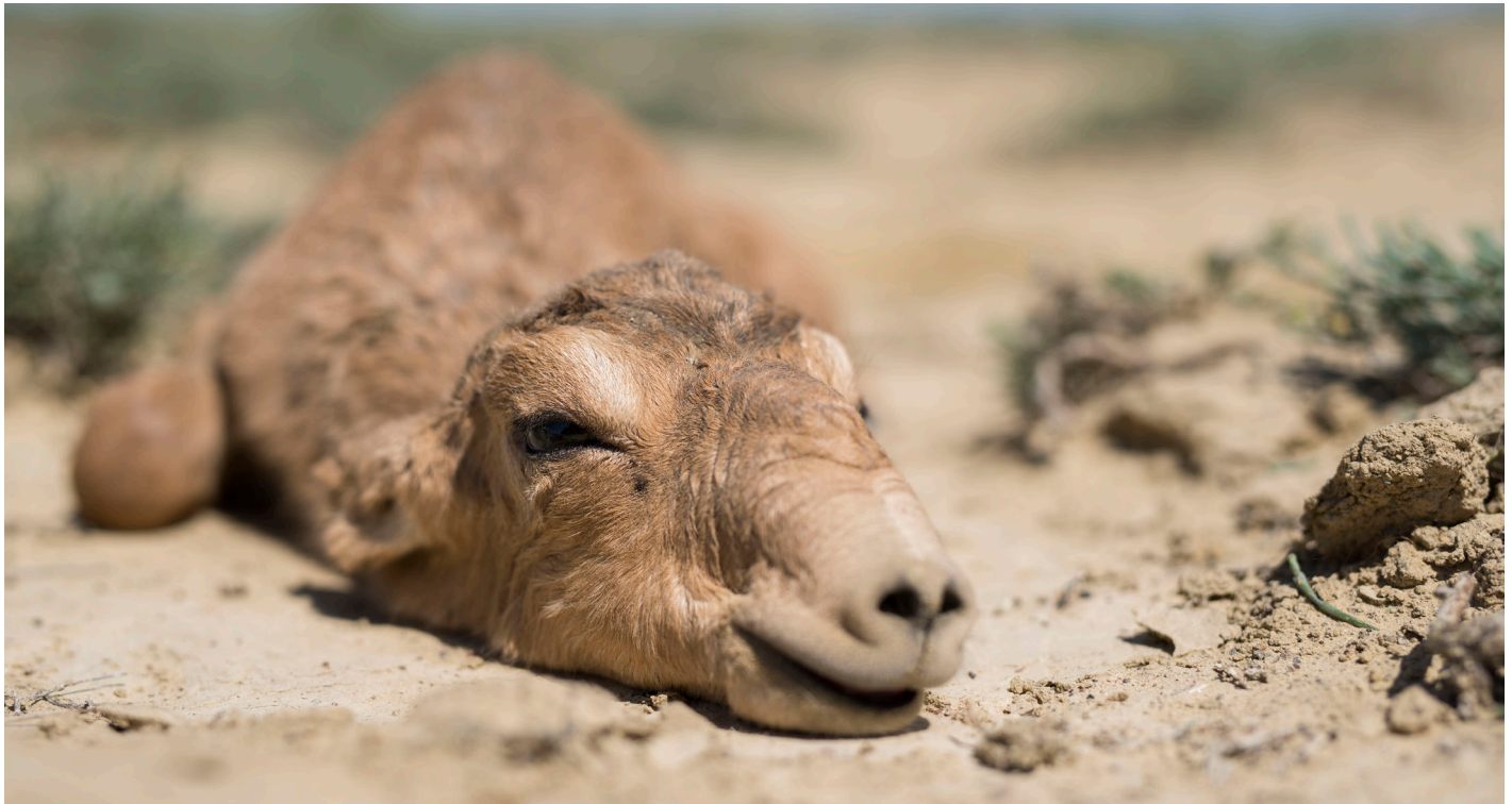
Saiga Antelope calf