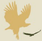
Vulture MsAP Range States and Regions