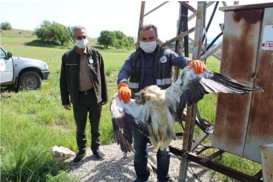
The heartbreaking story of ‘Polya’: A very promising future killed by electrocution.