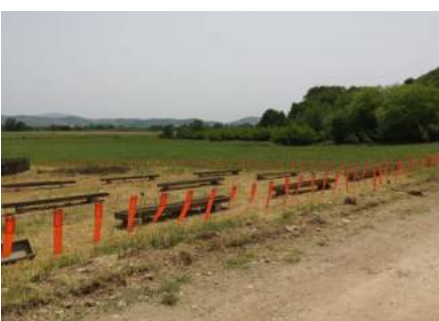
Pilot testing of fladry fencing to protect livestock animals.