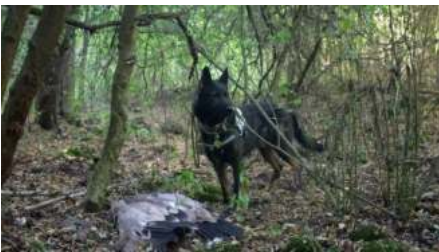
Public consultation of the national Antipoison strategy in Bulgaria.