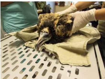
Another Egyptian vulture with a mission to help its species through an experimental method.