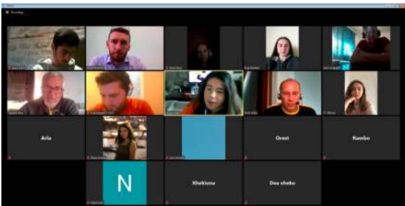
AOS helps in formalizing the Egyptian Vulture Conservation Youth Club in Gjirokastra.