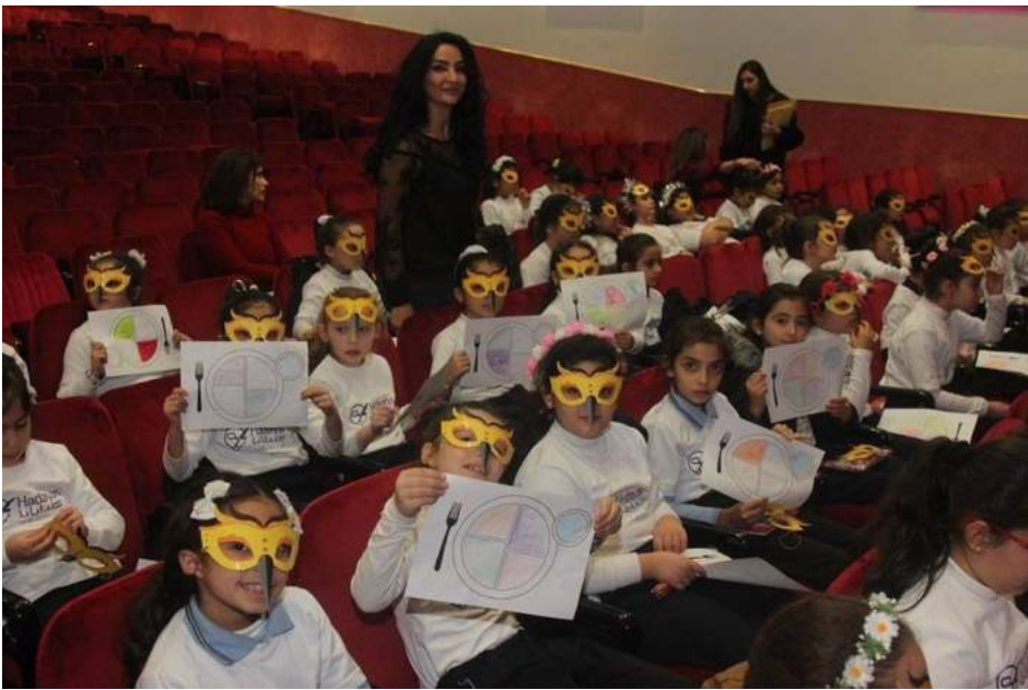
Awareness Program Activities about Egyptian Culture in Jordan.