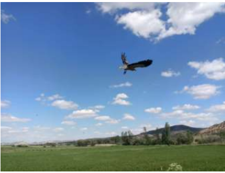
Ertale – a story with a happy end!