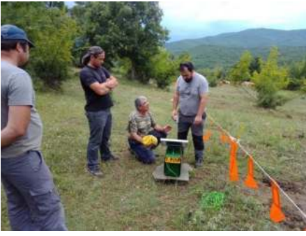
Can a piece of rope with coloured flags stop a wolf?