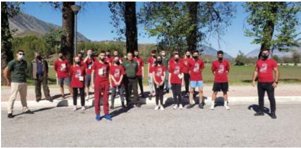
GjiroRun: A local marathon for the Egyptian culture in Albania.