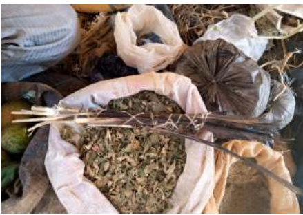
Illegal killing and use of vultures in traditional practices in Niger.