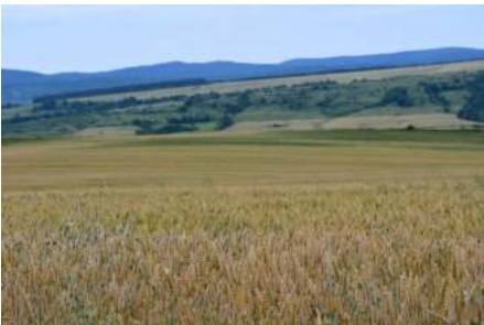
Results from the gap analysis report on the Albanian legislation and publicly available information regarding the agricultural chemicals.