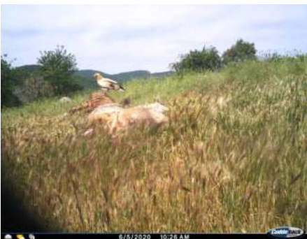
This year the vulture restaurant Vitachevo, located in Republic of North Macedonia is officially open for business.