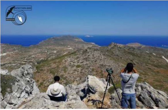
Egyptian Vulture migration monitoring on Antikythira Island, Greece 2020.