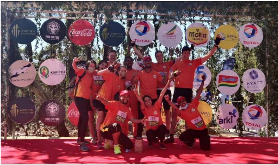
The Great Ethiopian Run 2020 to support Bird Conservation Efforts in Ethiopia.