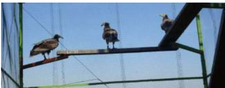
Three young Egyptian vultures are already flying freely in the skies of the Eastern Rhodopes.