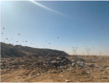
Survey on the threats for the Egyptian vulture in Suez, Egypt.