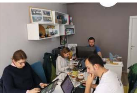
Results of The Desk-based Studies Regarding the Legislation for Veterinary Medical Products and Pesticides in North Macedonia.