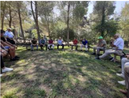
CITES handbook, a strong tool to raise capacities and prevent bird crime phenomena in Albania.