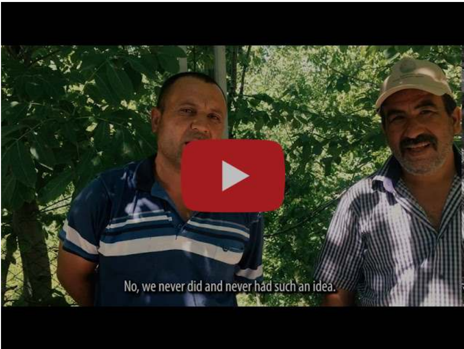
Nomads of the Bolkar Mountain, Turkey