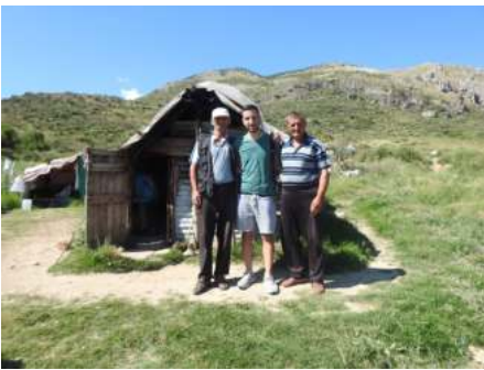
A short story, but a longlasting relationship: the “Savers of the Egyptian vulture” in Albania.