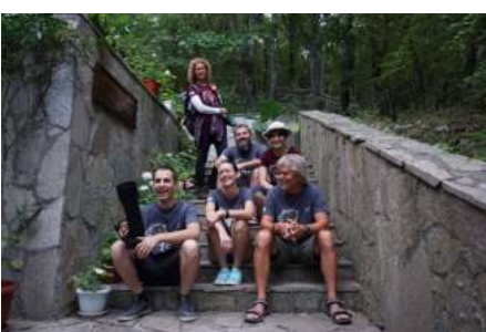
The nest guarding campaign during the catastrophic 2020.