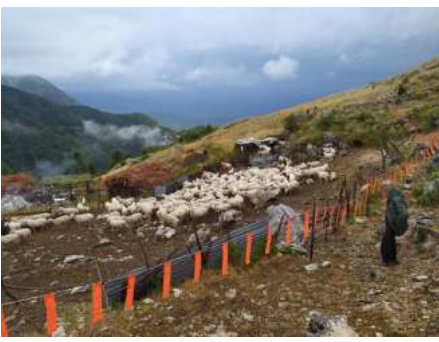
Pilot testing of fladry fencing and fox lights to protect livestock in Epirus.