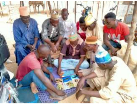
Develop the local capacity to combat illegal killing and trafficking of vultures in Niger.