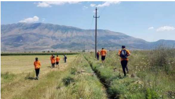
Wildlife conservation at a young age in Albania.