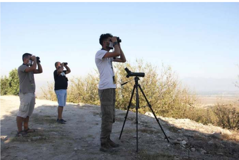
Sarimazi Raptor Count 2020