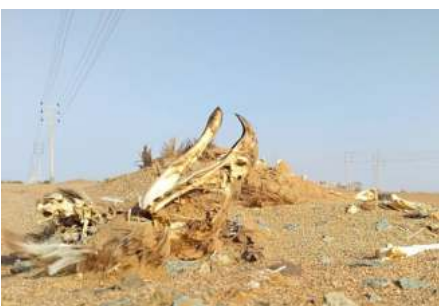
Hotspots for Bird Mortality due to Electric Infrastructure found in Saudi Arabia.