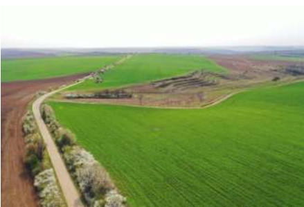
The impact of the use of pesticides in the Egyptian vulture in Bulgaria.