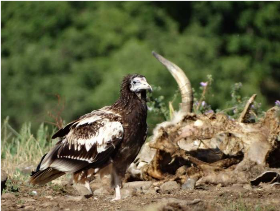
The Restocking in the Balkans – Season 3