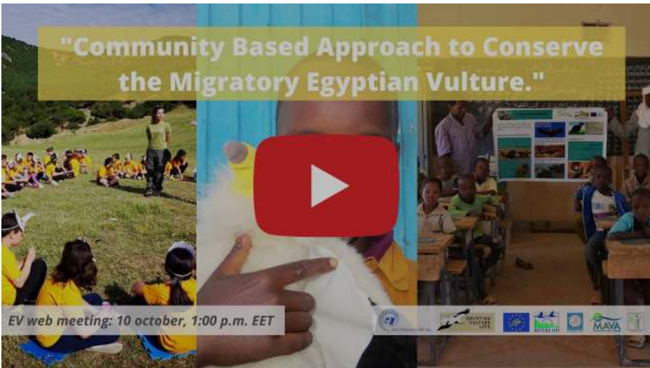
WMBD 2020 webinar: "Community Based Approach to Conserve the Migratory Egyptian Vulture"