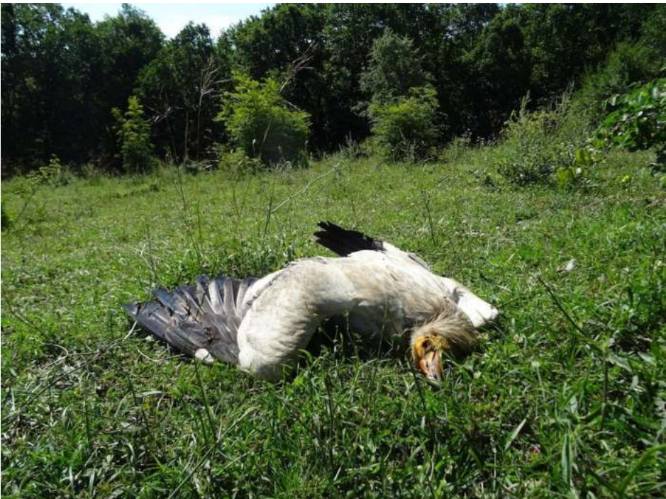
An Egyptian vulture's family died in the Eastern Rhodopes Mountain, Bulgaria.