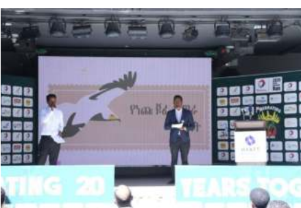
Crucial steps towards bird-safe energy infrastructure in Ethiopia.