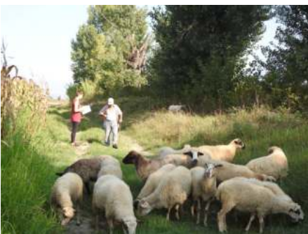
Results of the desk-based study about the Veterinary Medical Products in Albania.