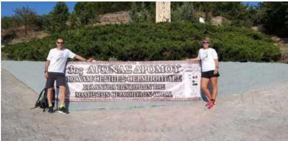
The team of the Egyptian Vulture at the international race "On the traces of heroes" in Greece.