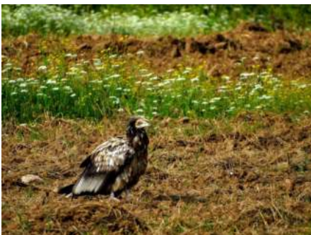
The young Egyptian Vulture Fer died in Turkey.