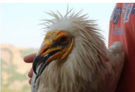
An iconic Egyptian Vulture found its death in Chad.