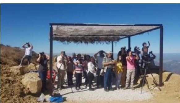
Raptor Count 2019 in Lebanon