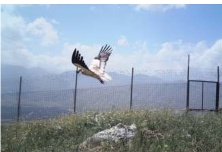
The success of supplementary feeding stations in Albania.