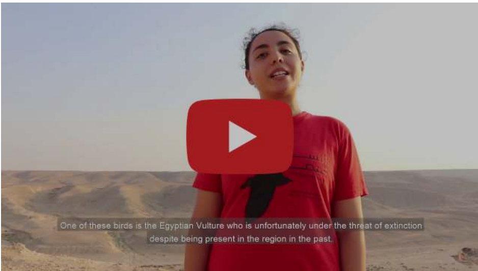
WMBD 2020 Egyptian vulture New LIFE challenge: Can we outrun real-time migrating Egyptian vultures?