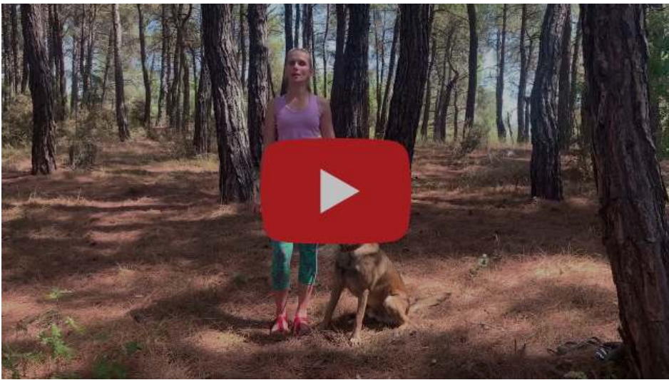
IVAD 2020 Egyptian Vulture webinar