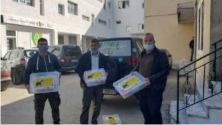
Egyptian vulture and poisoning in Albania: A destructive practice PPNEA is trying to address.