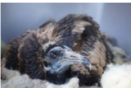
The fifth hero that overcame the dangerous Mediterranean - the Egyptian vulture Simeon.