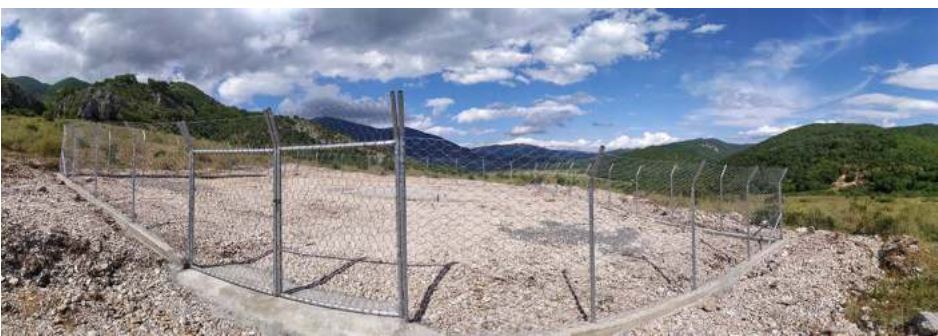
New supplementary feeding station in Epirus provides Egyptian vultures with safe food.