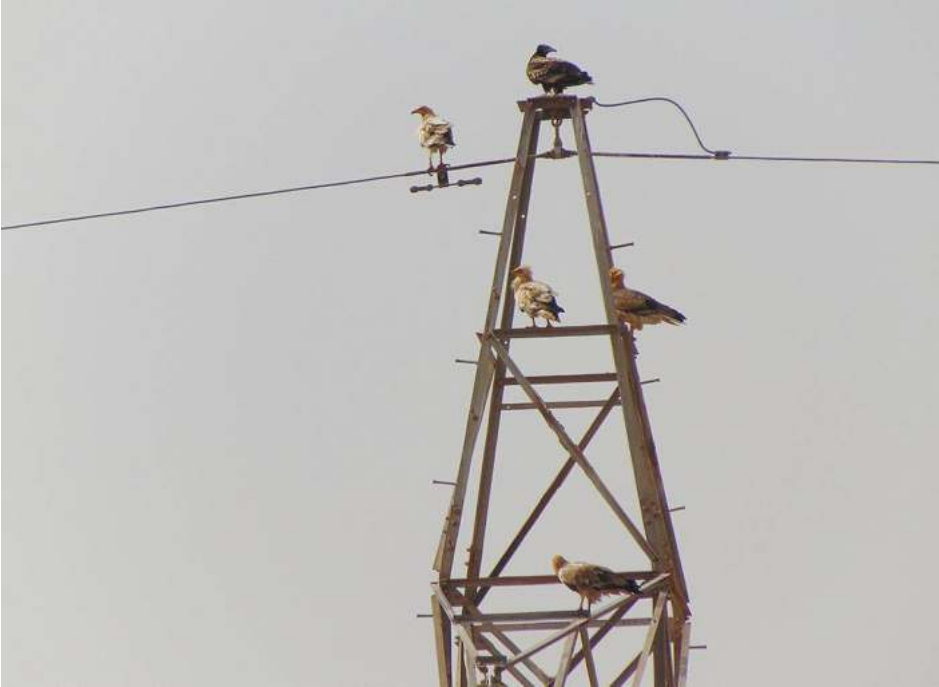
Congregations and threats for the migratory Egyptian vultures in Saudi Arabia.