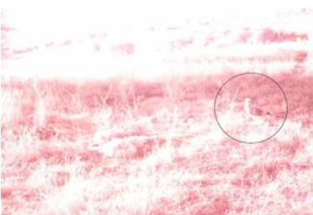
What happens with the new feeding site in the Eastern Rhodopes in 2020?