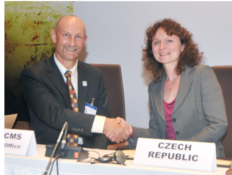
Signature ceremony on 5 November 2014, COP CMS