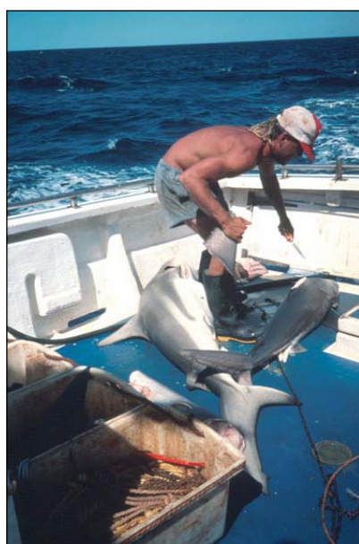
A fisherman fins sharks at sea in waters off Western Australia

None of the RFMOs has developed a regional plan of action as proposed by the IPOA. However, various measures, consistent with some of the principles of the IPOA have been implemented to initiate or improve data collection and shark stock assessment processes, raise