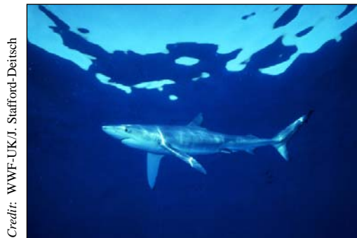
Blue Shark Prionace glauca

The first principle of the IPOA-Sharks requires managers to “ensure that shark catches from directed and non-directed fisheries are sustainable”. Confidence about sustainability requires