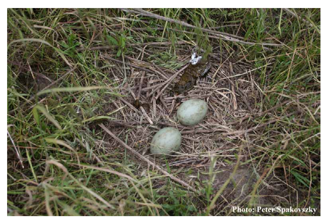
Figure 4: The female defecated into her nest, while she escaped.

At times we got information about a Great Bustard nest only indirectly or posterior. Farmers, shepherds, tractor drivers or hunters can give these reports, which are often irreplaceable, that's why it is very important to collect them. If we meet these people during our work, we should ask them about their experiments in reference to the Great Bustards. In this way we can be informed about an "unknown" breeding sites, and due to the nest site fidelity of the females (Alonso et al. 2000), we presumably will find nest in the same place in the future. As we found, they even notify us immediately as they find a nest for a small premium. This needs of course preliminary education, in the course of which we have to tell them what to do if they find a nest.