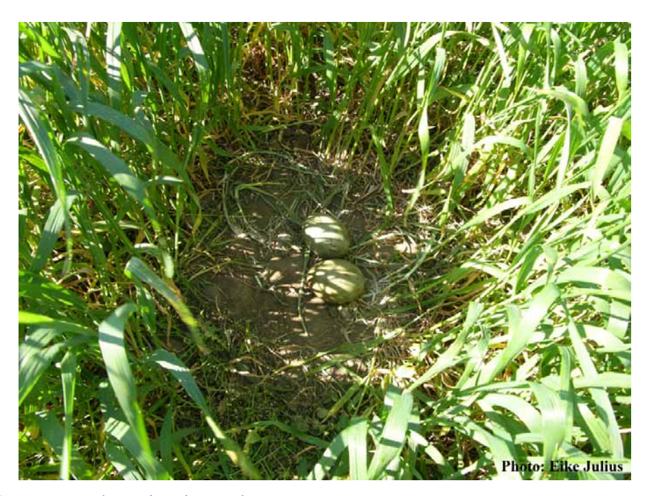
Figure 1: Great Bustard nest in winter wheat

The nest of a Great Bustard is generally only a shallow, 25-35 cm wide depression in the ground, deliberated bushing has not observed yet, if some plant pieces line the nest, this is supposedly accidental. The clutch is usually 2, more rarely 1 or 3 eggs, the olive-brown, olive-green or rarely pale blue, and well blotched with brown eggs are elliptical. The nests are in grass or crop as usual, mainly in winter cereals (figure 1), Papillionaceae or in other crops, but the fallows (see the photo in the front cover) are also a very frequent nesting site (Faragó, 1983, Morgado & Moreira 2000), although sometimes the eggs are laid in extremely unusual place (figure 2).