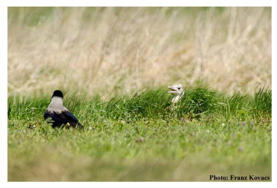
Figure 5: A female Great Bustard is sitting on eggs, in front of a lurking hooded crow.