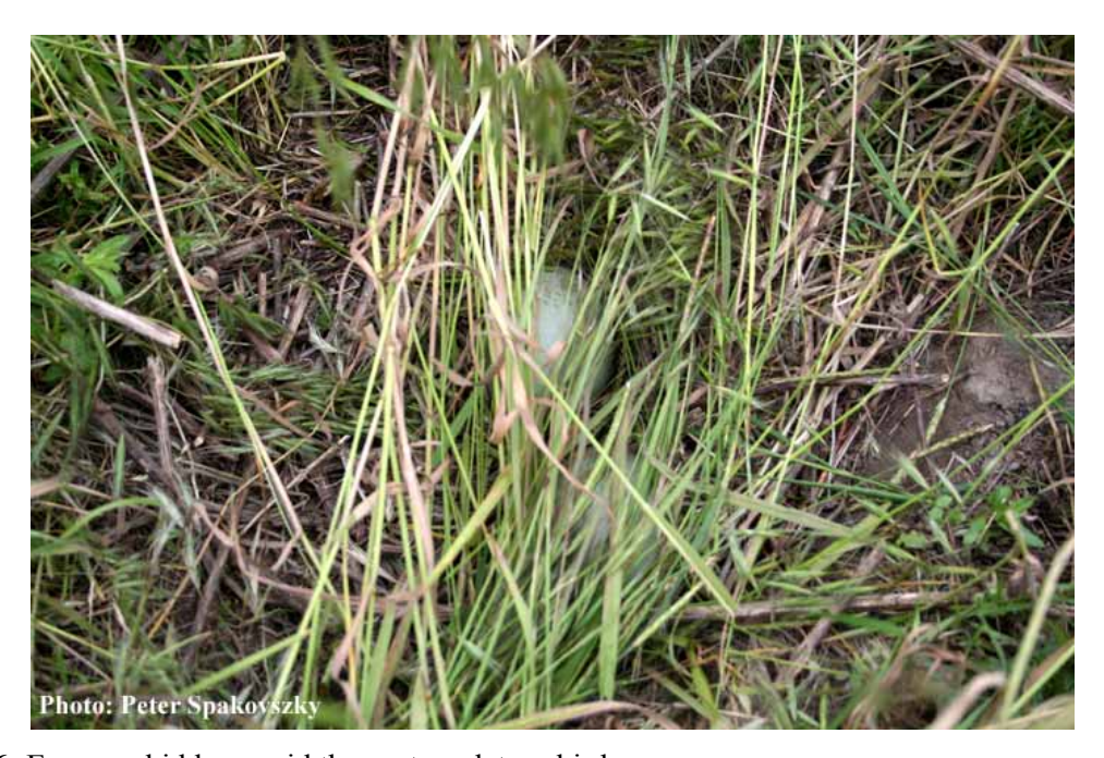
Figure 6: Eggs are hidden avoid the nest predatory birds.

But if we find a Great Bustard nest accidentally, or we have to search the nest just for the rescue of the hatch, then lets try notice the surroundings and fix the location, and leave the nest as soon as possible for opening the door to the female to come back to the nest soon. A Hungarian practice for avoiding the robbing by Corvids is the covering of the eggs by a handful of plants (Figure 6). More preferable to came back to the locality 26 days later, when the hatching has finished surely. There are a lot of signs which give a handle to us to draw a lot of conclusions at a retrieved or posterior found nest, too. If the transfer of the eggs is necessary, we have the possibility to take more measurements. Let us try to answer by the measurements for the next questions: