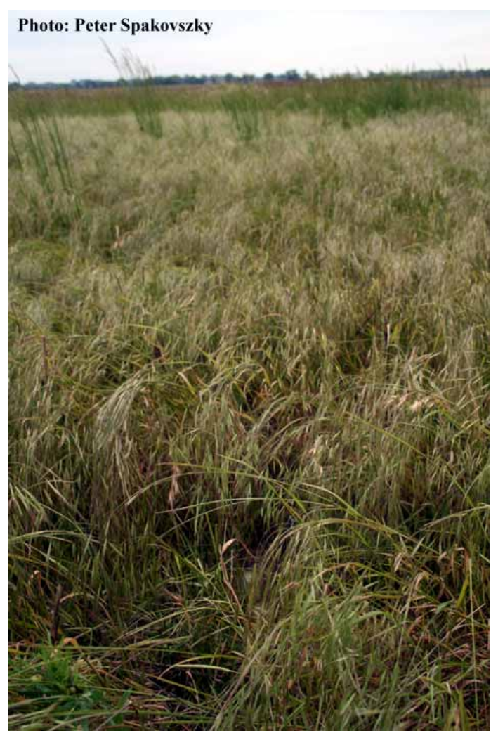
Figure 3: Great Bustard nesting site in fallow (Bromus grass). In the foreground there is a nest with 2 eggs, roughly 1 meter far from the point, where the photo was taken.

How can we find a Great Bustard nest? Although the eggs, the nest, moreover the female on the nest are considered relatively big, they are very hard to notice due to their colour camouflage so bewilderingly. The nest is nearly impossible to see from a distance of 10-20 m, if the vegetation reaches the 50 cm height (figure 3). We notice the nest or the hatching female only if the bird takes wing just before we step on it. In such a case the female very often drops into the nest (figure 4). It usually escapes from an approaching machine similarly in the last moment, moreover it sometimes staying calm sitting on its nest, while the machine passing above it, to expose itself to the danger. Hawk-eyed and patient bird watchers are able to find nests also like that they keep watch on the female, which is sitting on its nest or sneaking to the nest, but in tall vegetation it is very hard to glimpse a female in this way. A female can easily reveal her nearby nest with her typical behaviour, the females are hectic, worried, confused and often examine the sky as long as they interrupt the hatching. However we can see a female, which is sitting on its nest, we can measure out the nest by the help of two or more observation direction – to the construction of these observation directions a GPS appliance could be very useful, – by only a few meter miscalculation.