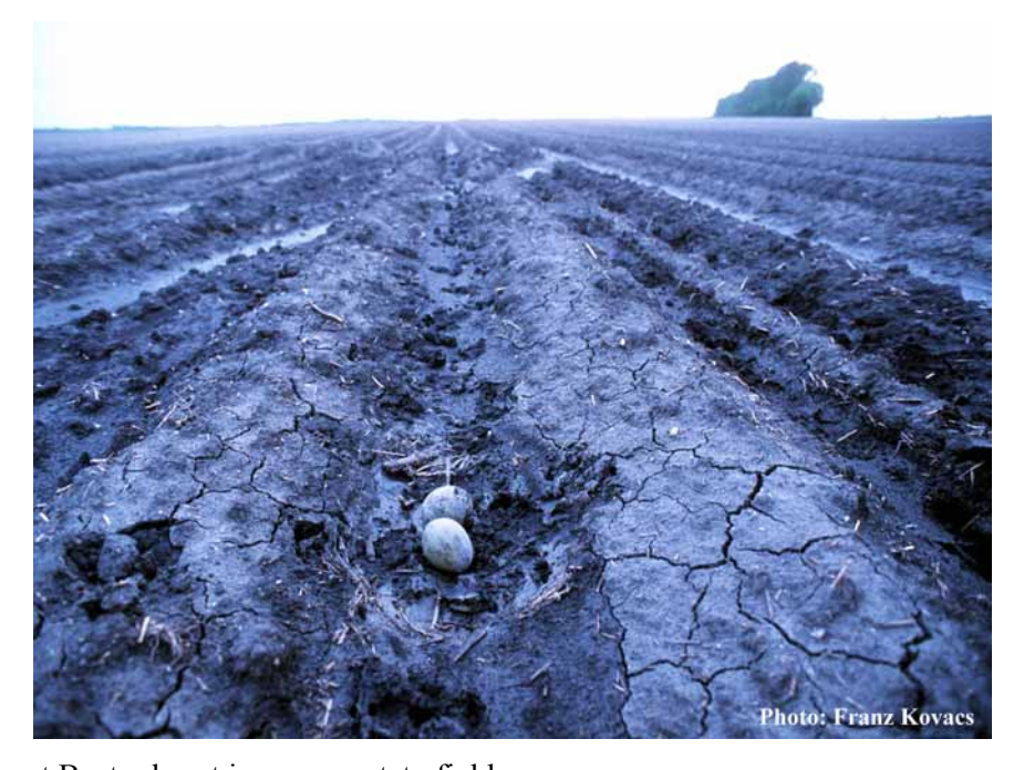
Figure 2: Great Bustard nest in a new potato field.