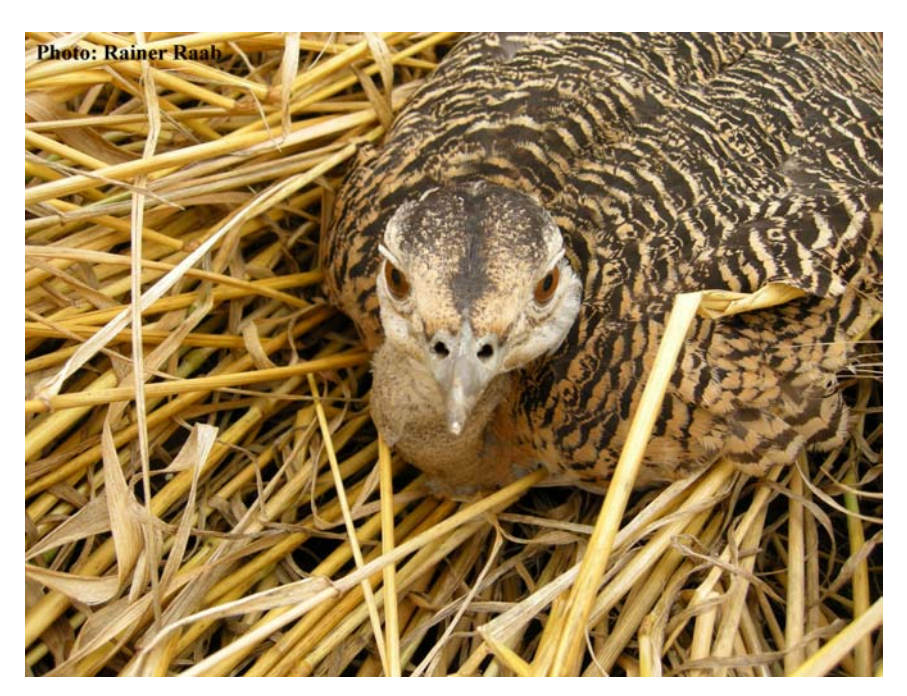
Figure 3: A squat chick which would be able to fly due to its development.