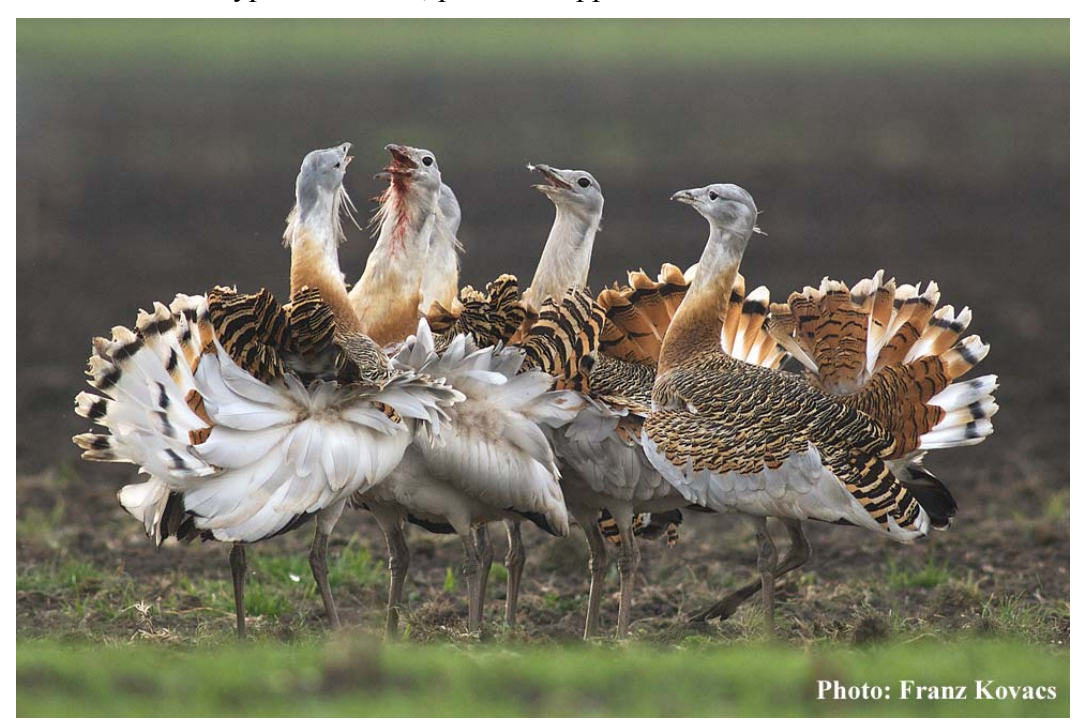
Figure 7: Adult males are fighting in spring. From this point of view the male in the right seems younger likely then the others, ranked to the second or the third age class.

much more brilliant than in neck category 1. The neck base is also bulkier due to the longer, hanging breast feathers, which according to Gewalt (1959) grow after the partial moult in winter to more than double their length of the non-breeding season. This provides the necks of adult males with their typical massive, powerful appearance.