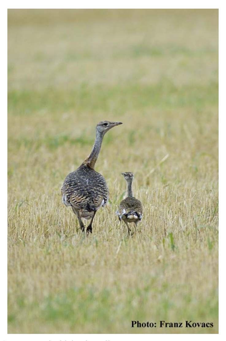
Figure 2: A female Great Bustard with her juvenile.