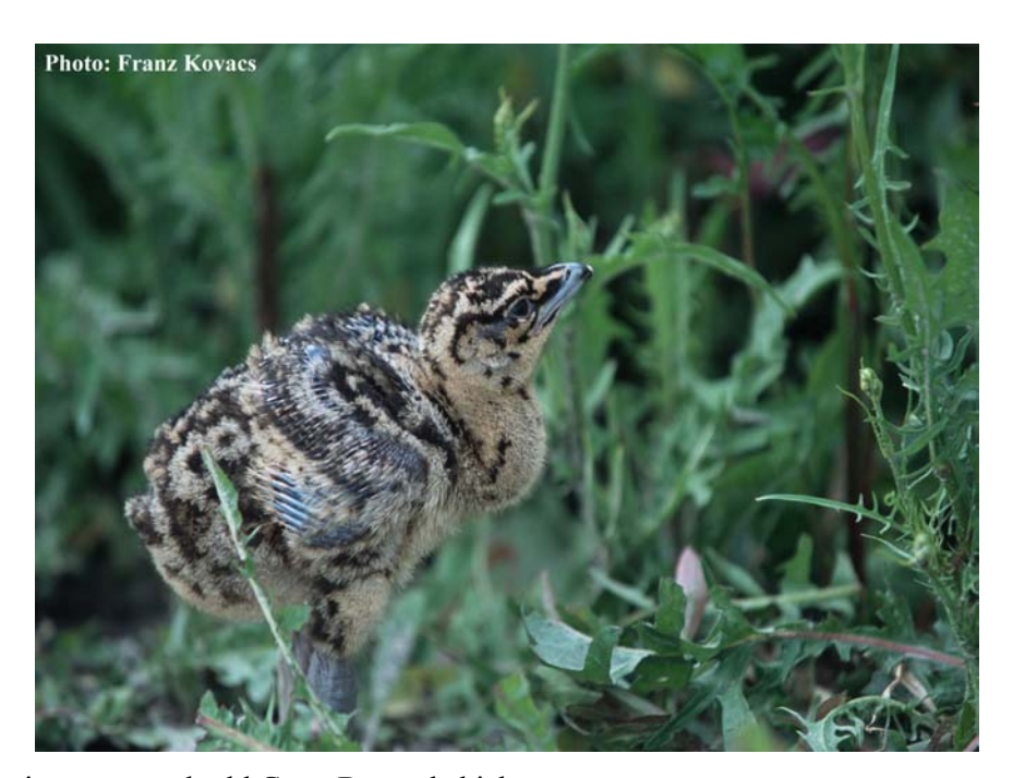
Figure 1: A circa one week old Great Bustard chick.

It is possible to deduce the age of the chicks from the state of their development. At the age of 1 week (figure 1), their primary feathers begin to grow, at the age of 2-3 weeks (figure 2), the tail and the body feathers are growing faster respectively, and as they are 1 month old, the first moult has nearly finished. The young Great Bustards reach the ability to fly, when they are 5-6 weeks old, although they rather squat in danger then fly in this time (figure 3). From this time their growth is roughly constant until they reach the size of their mother in generally September. Since this time to distinguish the juvenile from an adult undoubtedly is difficult in field, except the juvenile male, because they grow further, their size will bigger, their neck will broader usually in October compared to the females (Gewalt, 1959, Cramp & Simmons 1980).