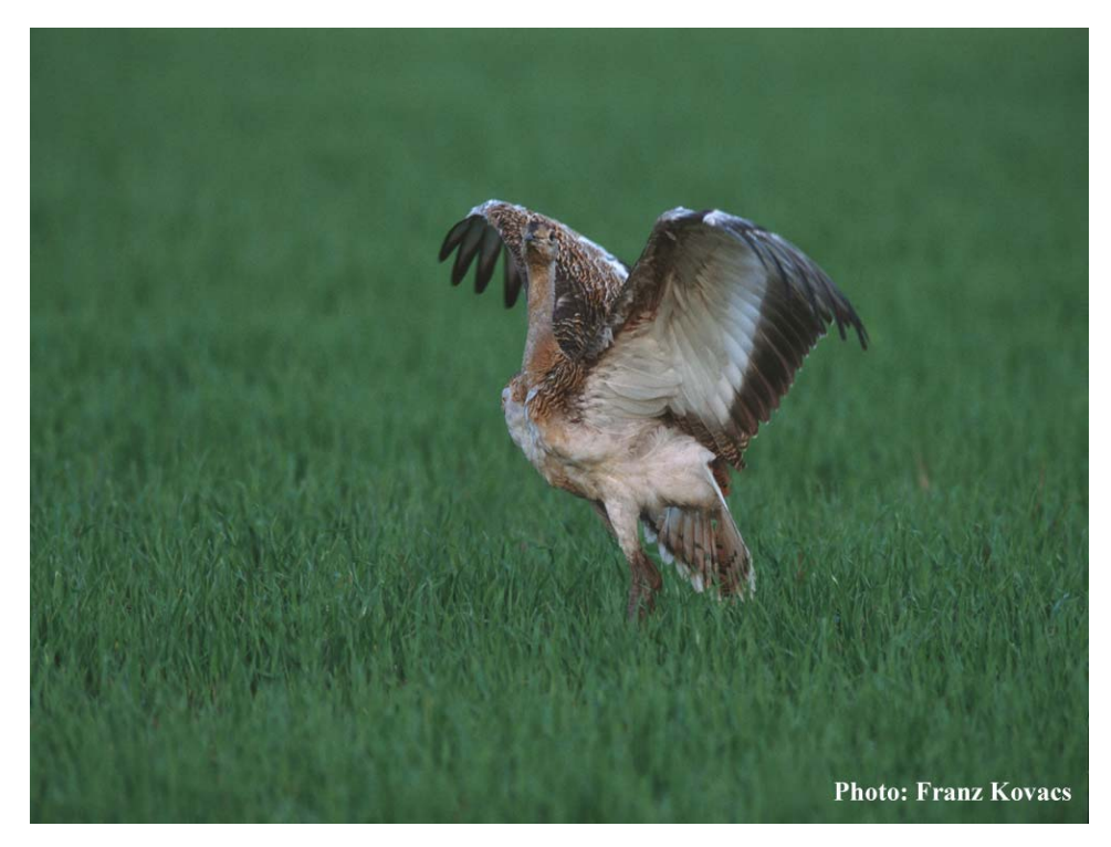
Figure 4: This juvenile Great Bustard has just reached the ability for fly.

Till this point of time quite easy to determine the age of a Great Bustard chick, but because of the usual hiding behaviour of them, generally most of the chicks grow up "invisibly", thus the occasional observations are not enough to draw a conclusion about the whole population.