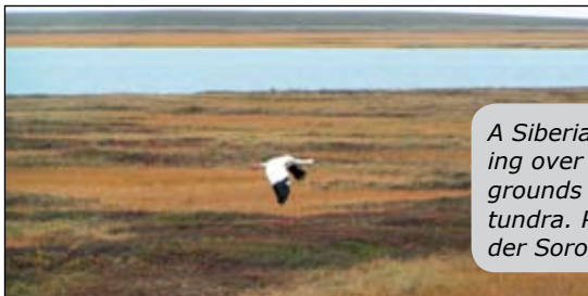
A Siberian Crane flying over the breeding grounds in the Yakutian tundra.

of an oil exploration drilling platform that was too close to a Siberian Crane breeding site. A new and innovative measure to enhance the security of the key Kunovat Federal Wildlife Refuge was the creation of a regional nature park around the reserve that serves as a buffer zone.