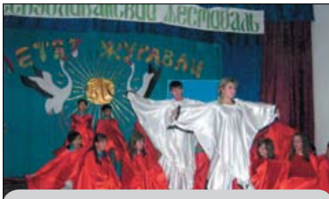
«Legend of the White Crane» presented at the 2007 Crane Festival.

Model education and public awareness programmes targeting different groups in the Kostanay Region are being incorporated into the educational system through a cycle of workshops to train the trainers . This innovative strategy