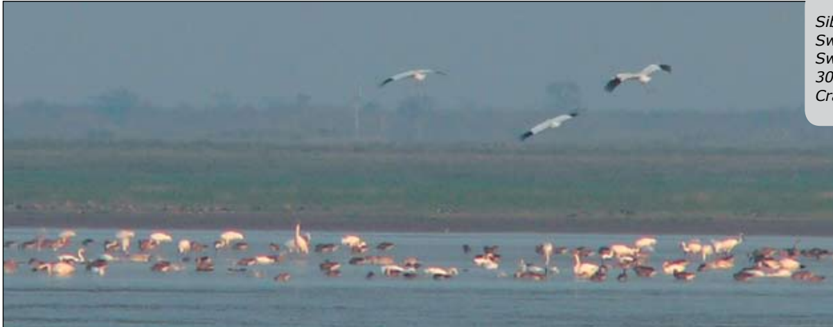
Siberian Cranes feeding with Swan Geese and Tundra Swans at Poyang Lake, 30 October 2005.

The Siberian Crane is an 'umbrella species' , a species whose habitat requirements are so broad as to encompass entire ecosystems – the conservation of their wetlands protects a wealth of species dependent on these same wetland ecosystems. More than this, the Siberian Crane's epic migration routes dramatically extend their 'umbrella' beyond their breeding wetlands to include their wintering wetlands and all the stopover sites they need along their migration routes. Their West/Central and East Asian flyways are used