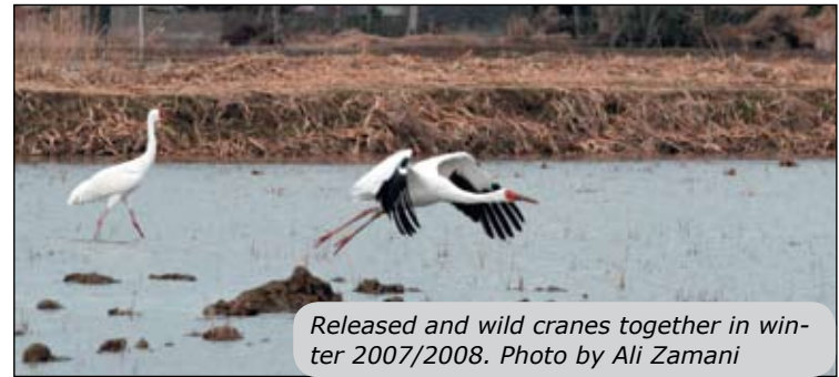
Released and wild cranes together in winter 2007/2008.

Fereydoon Kenar, recognized as an Important Bird Area for wintering waterfowl and the only site where wintering Siberian Cranes from the Western population have been recorded recently, provides a key example. The Fereydoon Kenar area consists of a small wildlife refuge surrounded by rice fields and traditionally-managed duck-trapping areas ( damgahs ).