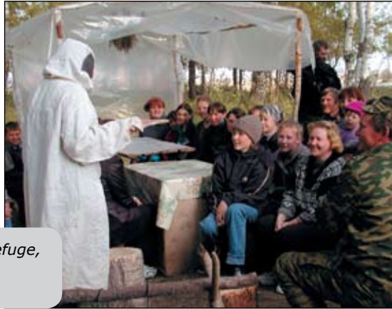
Crane Celebration in Belozersky Wildlife Refuge, Armizon District, southwest Siberia, 2003.

West Siberia is the centre of Russia's oil and gas industry, and Yakutia has diverse mineral resources as well as oil and gas. With energy of strategic importance to Russia, new develop-