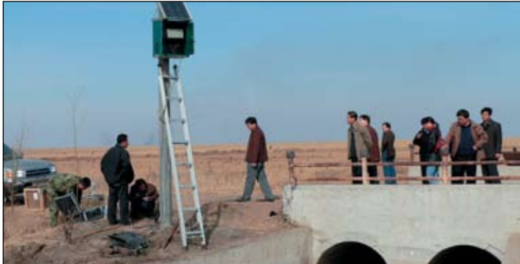
Installing a hydrological monitoring gauge at Zhalong NNR, 2005.

China has made a major commitment to conservation of wetlands and migratory waterbirds in the face of great challenges. In the north, growing demands for water and extended periods of drought have led to diversion of water away from protected