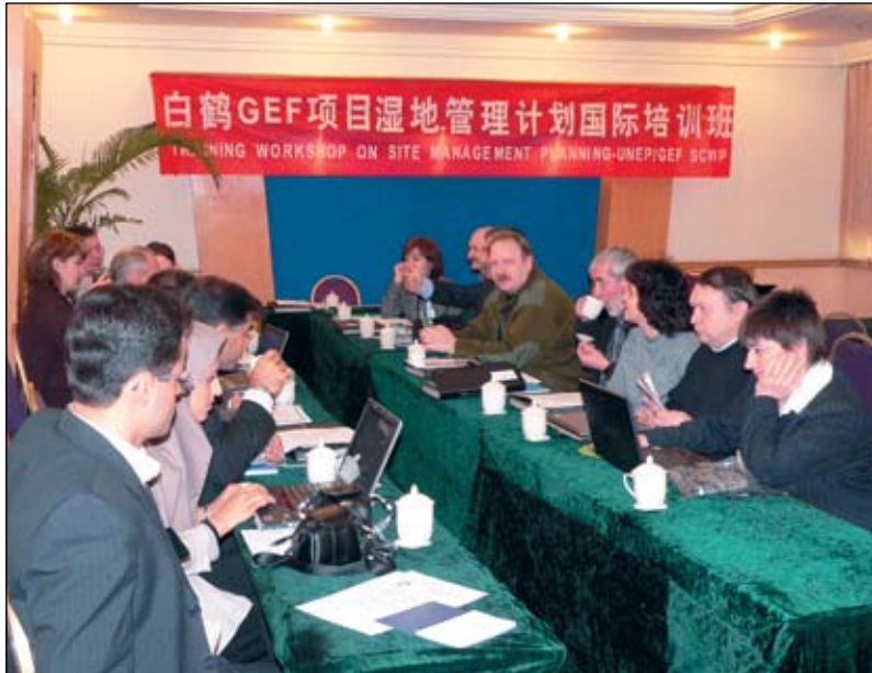
Regional training course on management planning in Nanchang, China, March 2007.

Education and public awareness programmes: Of the great successes, Crane Celebrations were initiated at many sites throughout the region and have been outstandingly creative and hugely popular. We estimate that they have now been held at over 100 sites spread over nine countries—inspiring children, local stakeholders, government officials, as well as potential donors.