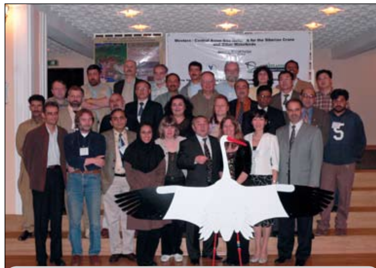
Launch of the Western/Central Asian Site Network for the Siberian Crane and Other waterbirds, Almaty, Kazakhstan May 2007.

land sites along the entire migratory pathways of the cranes. To achieve this, the SCWP promotes cooperation among the four countries, enhances interaction among sites and engages communities in the management of the wetlands along the West/Central and East Asian flyways for migratory waterbirds. Conservation actions within these flyways are coordinated with other initiatives for migratory waterbirds and closely integrated with the Conservation Plans created through the CMS MoU.