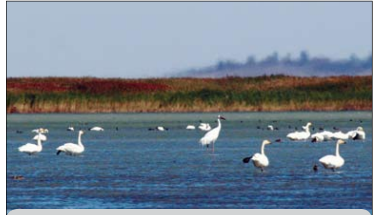
Siberian Crane with Whooper Swans and ducks at Naurzum Lake system, Kazakhstan, during autumn migration 2006.

Siberian Cranes are critically endangered as a result of hunting and habitat loss. The last known pair of the central population wintered in India in 2001/02. Unconfirmed sightings of