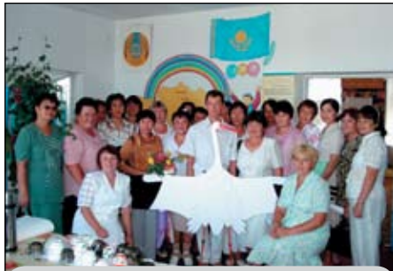
Teacher training in Karamendy Village.

The steppe lakes in the Kostanay Province of northern Kazakhstan lie on a major migration route for millions of waterbirds including the Siberian Cranes. Water levels are decreasing and lakes are drying due to highly variable rainfall combined with uncontrolled withdrawal of water by the local population.