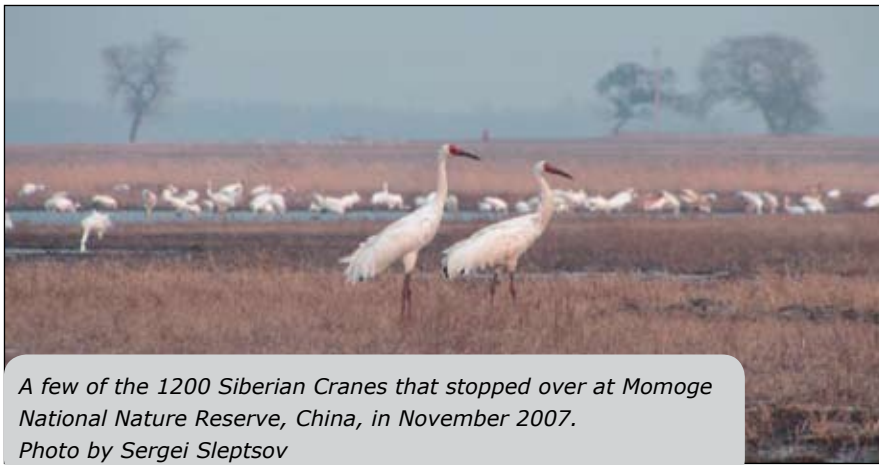
A few of the 1200 Siberian Cranes that stopped over at Momoge National Nature Reserve, China, in November 2007.

a few individuals of the central/western populations continue to be reported in Kazakhstan and Russia during migration, but only a single male was recorded at a known wintering site in Iran in 2007. Although only a very few may still survive, hope remains. The eastern population wintering in China at Poyang Lake has been reported as more than 3500 birds, but their numbers may be due to a concentration of birds as other winter habitat is lost. The plight of this extraordinary species has inspired many people to protect them and their wetland homes, but the challenge is great. The future of this great white crane depends on coordinated action all along their flyways.