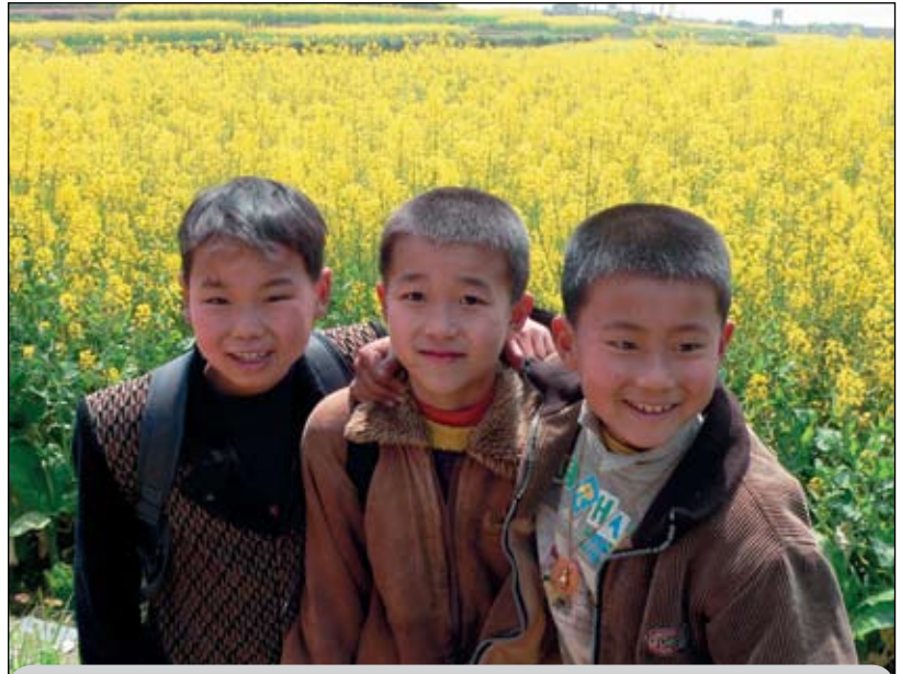
Children at Chian Village, a community pilot project site supporting a county nature reserve at Poyang Lake, China.

Future work will be carried on by government managers, by better trained reserve staff, by NGOs and by local communities—leaders, teachers and students—who have become