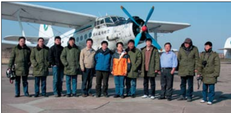
Aerial survey team under the UNEP/GEF SCWP, NE China, April 24-26, 2008.

Plans for three key reserves in northeast China. These ecosystem management plans supported cooperation with regional water management authorities to secure the water flows needed to sustain the natural functions of the wetlands.