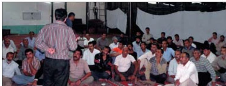
Community Meeting at Fereydoon Kenar, 2007.

While the work on community participation at Fereydoon Kenar has already influenced attitudes among the parties