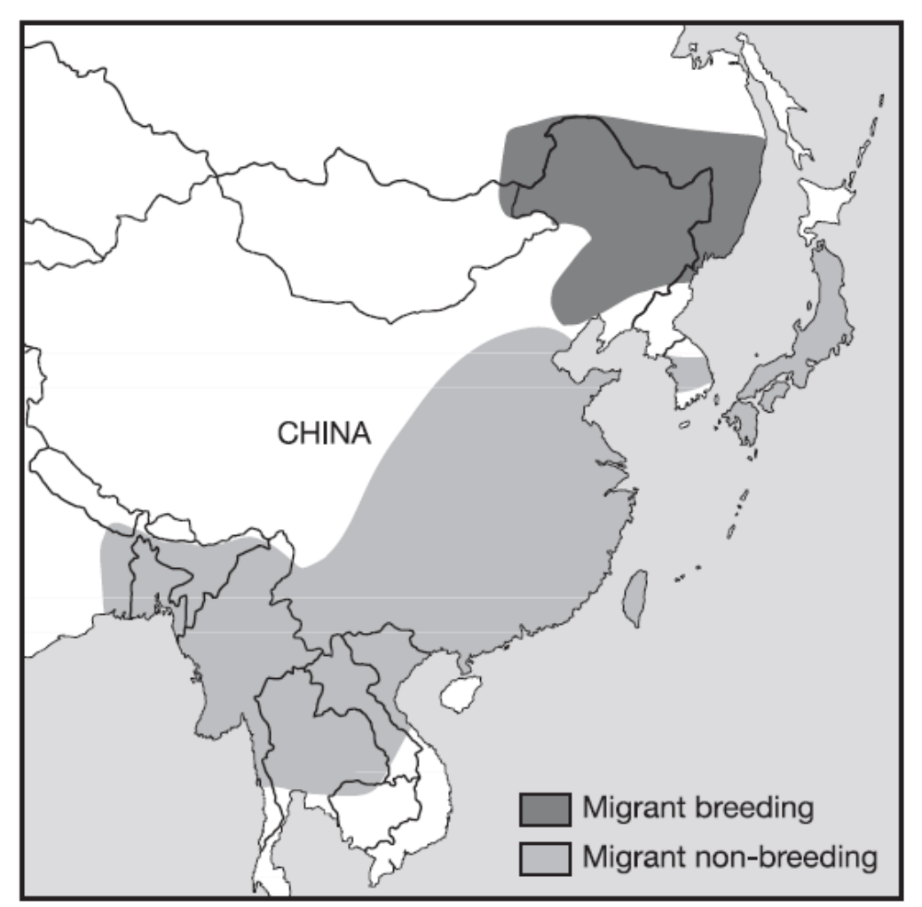
Figure 1. Range of Baer's Pochard (from Callaghan 2005).

In Mongolia, it is considered to be a scarce passage migrant, occurring singly or in pairs in the east of the country during late April-early May and late August-early September (Gombobaatar & Monks 2011).