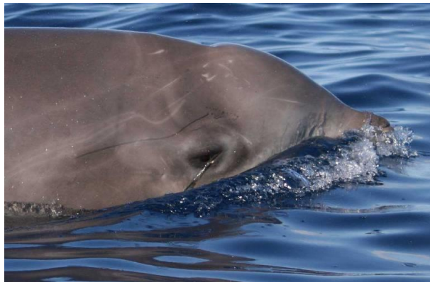
Figure 3: Sign of interaction with fisheries, a hook from a long-line in the external ocular region of a Cuvier's beaked whale off El Hierro, in the Canary Islands. (Photo: University of La Laguna, with permit from the Canary Islands Government).

Bycatch of beaked whales has been documented in different fisheries and geographical areas, from the Mediterranean to the Pacific, involving mainly Cuvier's beaked whales but also species of genus Mesoplodon and unidentified beaked whales (di Natale 1994; Carretta et al. 2008). Fourteen Cuvier's beaked whales were reported as having been captured intentionally between 1972 and 1982 (11 in French waters and 3 in Spanish waters), all shot and 1 also harpooned (Northridge 1984).