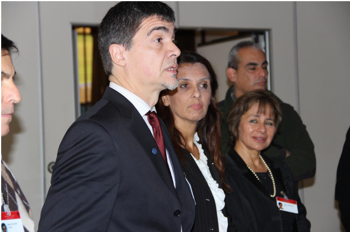
Participants during the exercise of simulation