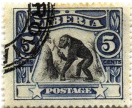
Figure 2. Liberia postage stamp, 1906, illustrating chimpanzee tool use.

Routes for this will be explored at the initial meeting outlined above. Conventional opportunities are provided by newsprint, TV and online, noting that although computers and tablets may be relatively rare especially in rural contexts, mobile phones with internet access are becoming much more common. Less conventional possibilities to be explored include a form of 'citizen science' along the lines of such activities as 'the big butterfly watch' in the United Kingdom, in which the public input their local discoveries to a central database. Yet more imaginatively, we may recall that in 1906 Liberia printed a stamp celebrating tool use by Chimpanzees (Figure 2); perhaps an equivalent stamp or even currency note portraying nut-cracking could be encouraged, taking different but related formats as a Concerted Action across range states to celebrate this unique cultural and scientific heritage.