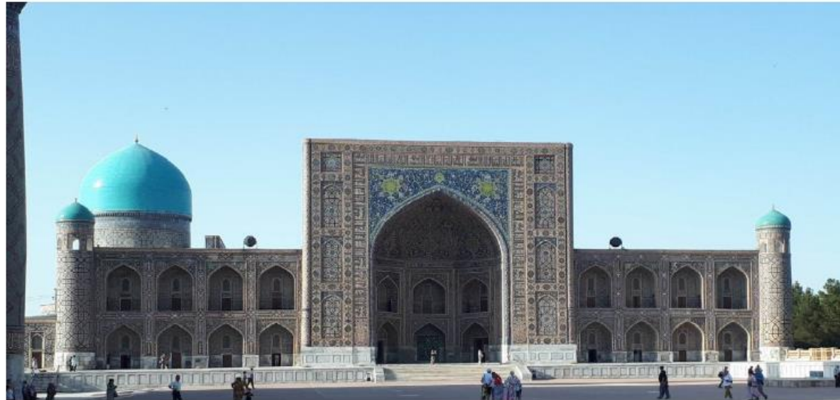
CMS COP14 - Samarkand, Uzbekistan 23-28 October 2023