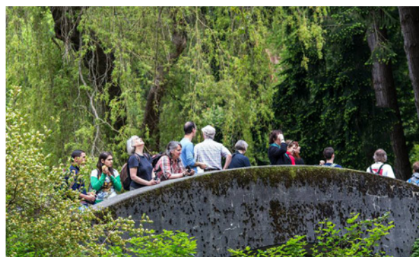
Birdwatching in Stanley Park, Vancouver

During the week of 6-12 May, 2013 the City, along with the Stanley Park Ecology Society, Bird Studies Canada, Nature Vancouver, Tourism Vancouver and other partners, recognized World Migratory Bird Day in a series of events held across the city. The City of Vancouver Park Board proclaimed World Migratory Bird Day, in a declaration signed by Mayor Gregor Robertson. The declaration recognizes the better management of birds and their habitats through initiatives such as Vancouver's Greenest City 2020 Action Plan would benefit residents and over 407 bird species.