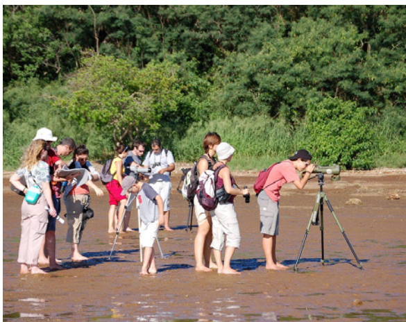
World Migratory Bird Day Event (New Caledonia)