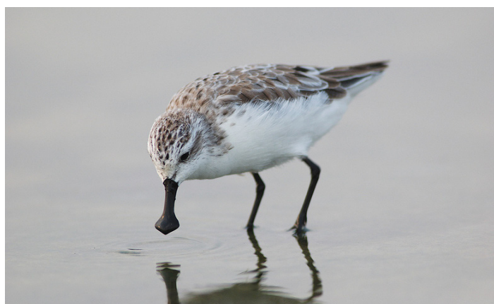
Spoon-billed Sandpiper ( Eurynorhynchus pygmaeus )

Migratory waterbird species that depend on the intertidal habitats along the East Asian-Australasian Flyway – which stretches from Russia to New Zealand and encompasses some 22 countries – are showing rapid decline and are among the planet’s most-threatened migratory birds. Coastal land reclamation, particularly around key coastal staging areas in the Yellow Sea, has caused this decline.