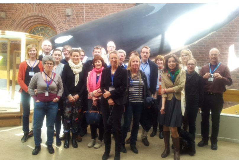
Meeting of the Jastarnia Group, Natural Museum of History, Gothenburg