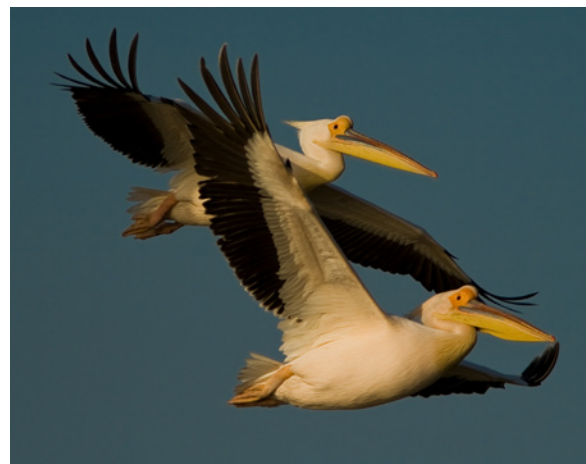
White Pelican (Pelecanus erythrorhynchos)

This year's Day highlighted the importance of ecological networks for the survival of migratory birds, the important human networks dedicated to their conservation, the threats migratory birds face, and the need for more international cooperation to conserve them. A regional event along the African-European Flyways was held on the shores of Kenya's Lake Elementaita to pay tribute to the