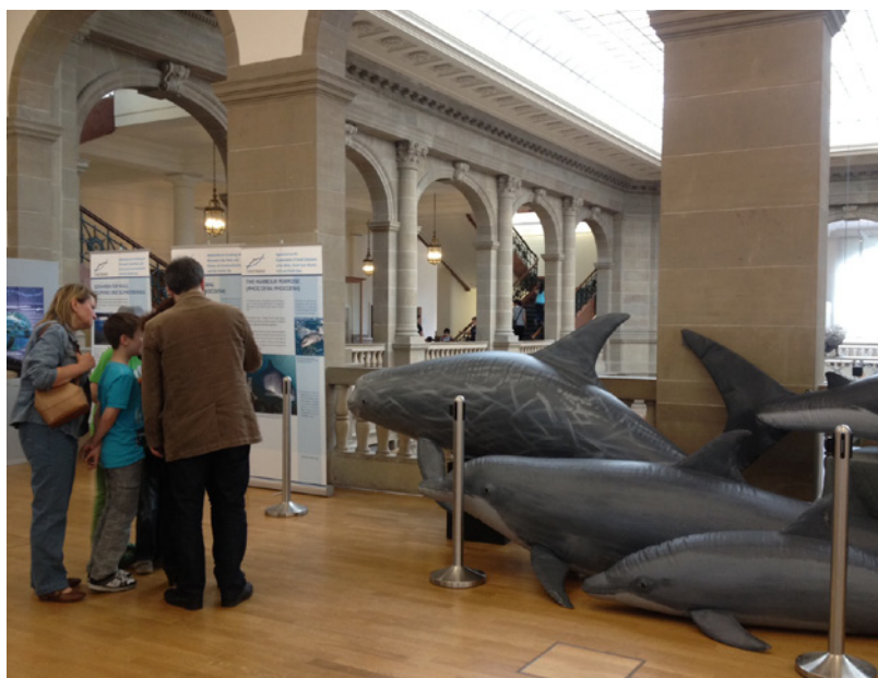
Educational activities during ASCOBANS Roadshows