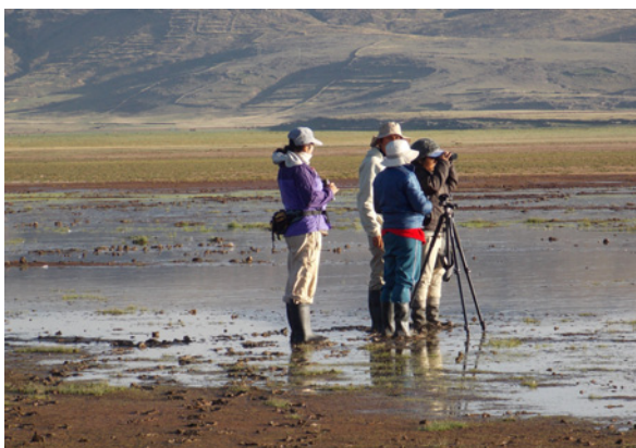
Monitoring Andean Flamingos

Andean Flamingos bring life and colour to the marshes, lagoons, estuaries and lakes they inhabit. Flamingos are some of the largest birds found at high altitudes of 4,000 meters. They are habitat specialists, have specific eating habits and move to different habitats depending on seasonal changes