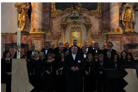
Bologna Opera Choir in Namen-Jesu-Church, Bonn