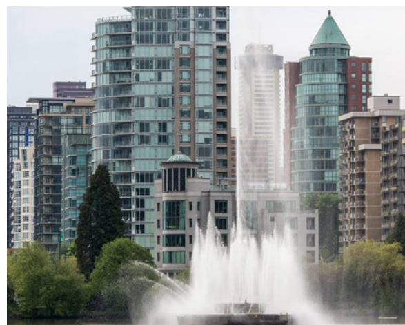
Vancouver Skyline

During the week of 6-12 May, 2013 the City, along with the Stanley Park Ecology Society, Bird Studies Canada, Nature Vancouver, Tourism Vancouver and other partners, recognized World Migratory Bird Day in a series of events held across the city. The City of Vancouver Park Board proclaimed World Migratory Bird Day, in a declaration signed by Mayor Gregor Robertson. The declaration recognizes the better management of birds and their habitats through initiatives such as Vancouver's Greenest City 2020 Action Plan would benefit residents and over 407 bird species.