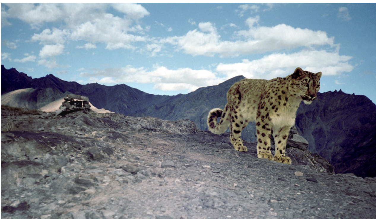
Snow Leopard on the lookout, Hemis National Park, Jammu and Kashmir, India

It also complements efforts of the World Bank Global Tiger Initiative to develop a Global Snow Leopard Ecosystem Protection Programme to be adopted at the International Snow Leopard Conservation Forum later this year. ■