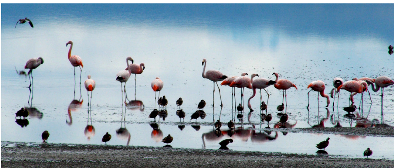
Andean Flamingos and other waterbirds

As research and monitoring programmes are essential to effectively protect the species, CMS de-