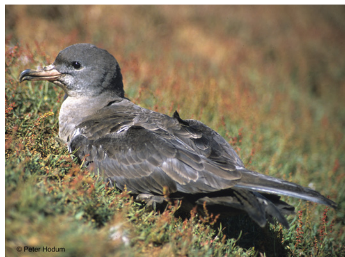
Pink-footed Shearwater

continued, and shows a continuous increase of the population size reaching 38 pairs in 2012. However, the breeding success appears to continue to decline progressively. Since 2011 a comprehensive study of the diseases occurring in the 5 main sea-bird species at Amsterdam has been carried out. The study shows that avian cholera and Erysipelas was present in all species including Amsterdam