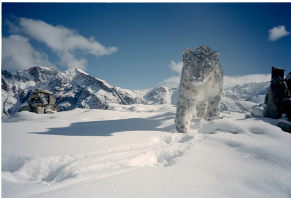
Snow Leopard on the hunt, Hemis National Park, Jammu and Kashmir, India

The CMS Small Grants Programme is funding a project supporting Tajikistan to lead on transboundary cooperation on Snow Leopards. The project is implemented by Flora & Fauna International in collaboration with the Department of Forestry and Hunting under the Committee of Environmental Protection of the Republic of Tajikistan. Other