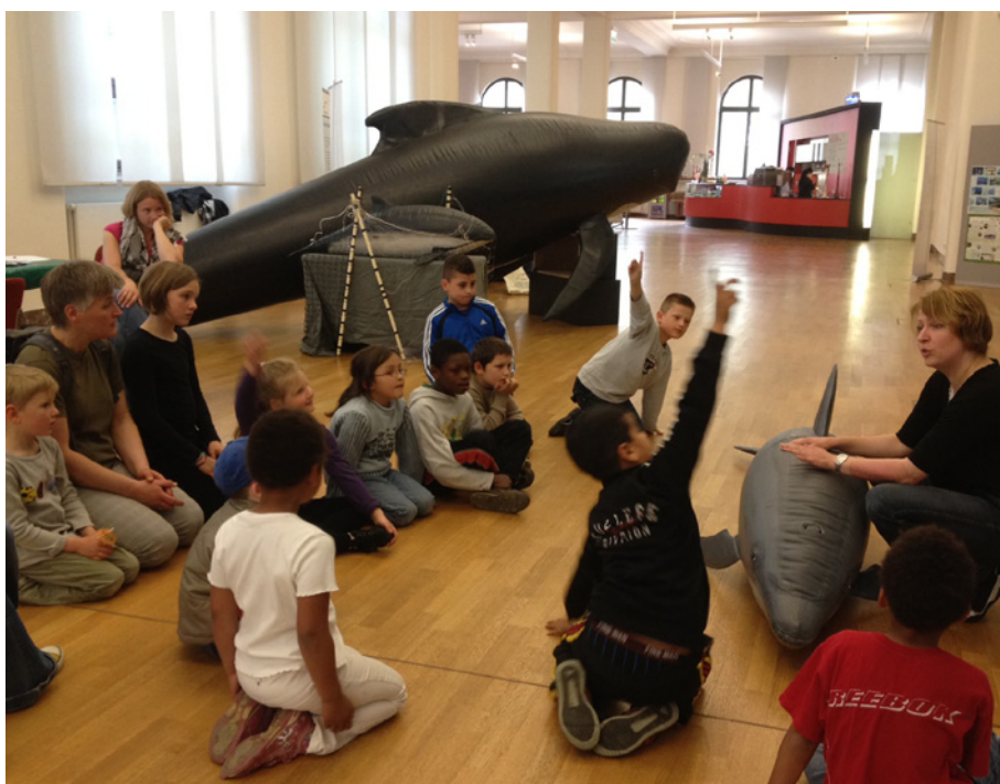
Educational activities during ASCOBANS Roadshows

In order to recruit creative minds for the cause of the harbour porpoise, the ASCOBANS Secretariat and its NGO partners, Whale and Dolphin Conservation (WDC), NABU and OceanCare, have launched the creativity competition