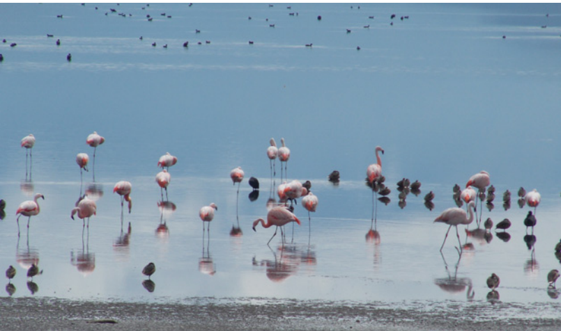
Andean Flamingos in wetlands, Peru

The 22 known sites will be reassessed in August 2013, austral winter in the Southern hemisphere and dry season in the highlands. They will be evaluated again in February 2014, during austral summer wet season. New locations will be selected and evaluated. Geographic Information Systems, a database of 88 sites proving the historical presence of flamingos, 900 potential lakes, the 22 known sites and bio-climatic data will help identify potential new areas. ■