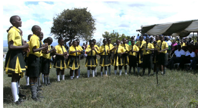
Performance of school children