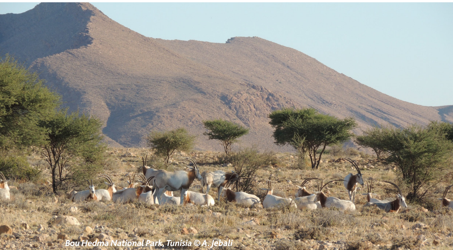
Bou Hedma National Park, Tunisia

SSIG meetings provide an opportunity to exchange ideas and to join forces to continue working on behalf of Sahelo-Saharan wildlife and people. Presentations and discussion groups cover a number of topics. The meeting is facilitated by the Sahara Conservation Fund. ■