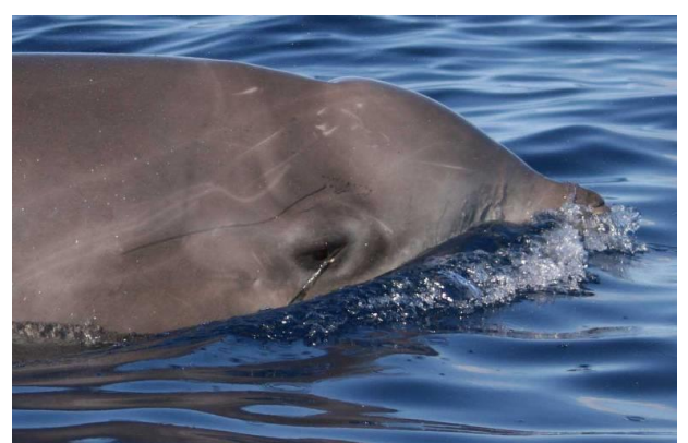
Figure 3: Sign of interaction with fisheries, a hook from a long-line in the external ocular region of a Cuvier's beaked whale off El Hierro, in the Canary Islands.

Bycatch of beaked whales has been documented in different fisheries and geographical areas, from the Mediterranean to the Pacific, involving mainly Cuvier's beaked whales but also species of genus Mesoplodon and unidentified beaked whales (di Natale 1994; Carretta et al. 2008). Fourteen Cuvier's beaked whales were reported as having been captured intentionally between 1972 and 1982 (11 in French waters and 3 in Spanish waters), all shot and 1 also harpooned (Northridge 1984).