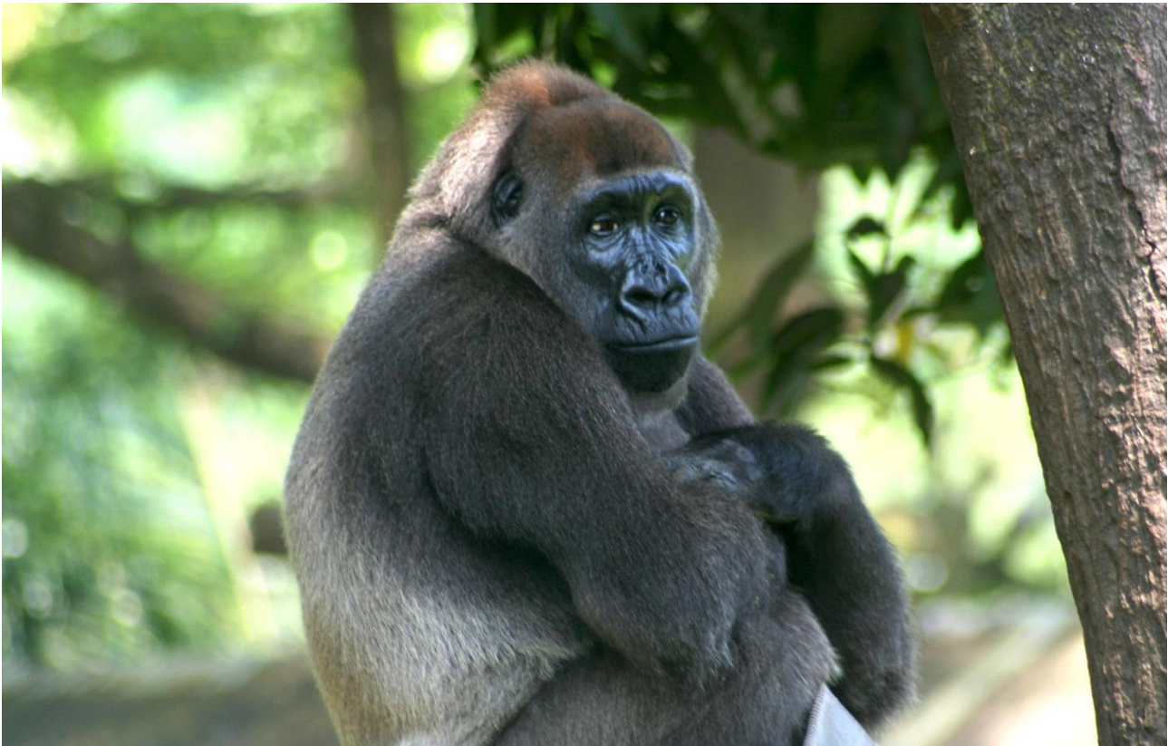
Cross River gorilla ( G.g. diehli ) © Julia Langford

The Cross River gorilla ( G.g. diehli ) is the least abundant great ape of the African continent and is currently classified as “Critically Endangered” on the IUCN Red List of Threatened Species. 5 It gets its name from its habitat on the upper drainage of the Cross River on the Nigeria-Cameroon border. An estimated area of 700 km 2 , extending 30-40 km on either side of the border, is used by an estimated 218-309 mature gorillas. 6 This small population is in decline, severely fragmented into 11 subgroups or subpopulations (maximum number of individuals in the largest subgroup is 30) and potentially at risk from inbreeding and loss of genetic diversity. 7 Approximately two-thirds of the entire Cross River gorilla population are found in Cameroon.