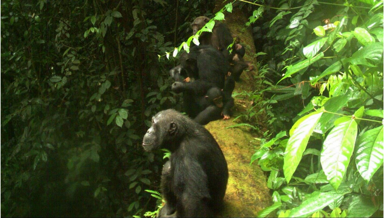
Nigeria-Cameroon chimpanzee ( Pan troglodytes ellioti )