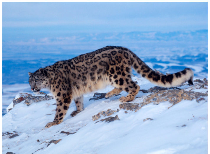
Snow Leopard

In India, Snow Leopards inhabit the high-altitude region of the Jammu and Kashmir and Ladakh, and the States of Himachal Pradesh, Uttarakhand, Himachal Pradesh, Sikkim and Arunachal Pradesh. Current estimates of its population in the country range between 500 and 700 individuals. The Government of India launched the Project Snow Leopard (PSL) in 2009 to safeguard the species as well as associated high-altitude wildlife populations and their habitats. Through the project, the unique conservation challenges of high-altitude regions are being addressed using a landscape-based approach to conservation that goes beyond protected areas (PAs). The key initiatives undertaken under PSL include recovery programmes for endangered species, restoration of degraded landscapes, improved PA management, stronger law enforcement and protection of important traditional pastoral economies and lifestyles, while reducing anthropogenic pressures.