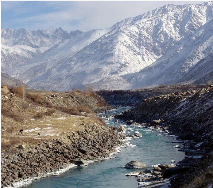
In winter the upper course of the Panj-Amu Darya River in Wakhan separates Tajikistan (left) from Afghanistan (right) just a stone's throw apart and so no significant obstacle to large free-ranging mammals.

More information about the bilateral MoU between Afghanistan and Tajikistan can be found here: https://untj.org/?p=15028