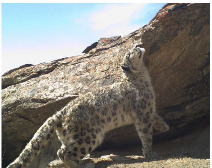
Snow Leopard Sarychat 2019