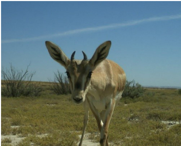
Goitered Gazelle in Kazakhstan