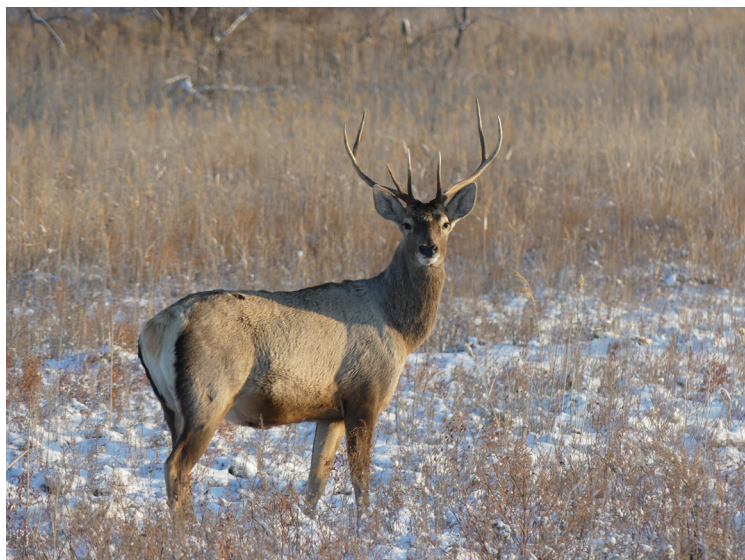
Bukhara Deer in Ile Balkhash, Kazakhstan

Government representatives, NGOs and experts agreed on a new five-year work programme for the conservation of the Bukhara Deer ( Cervus elaphus bactrianus ). The work programme as well as a comprehensive overview report on the conservation status of the species was reviewed during a technical workshop under the CMS Memorandum of Understanding concerning the Restoration and Conservation of Bukhara Deer ( Cervus elaphus bactrianus ), which took place on 20-22 October 2020 using a virtual platform. The MOU was signed on 16 May 2002 by four Range States: Kazakhstan, Tajikistan, Turkmenistan and Uzbekistan. The International Council for Game & Wildlife Conservation (CIC) and WWF Russia have signed the MOU as cooperating organizations. Representatives from Afghanistan also participated in the meeting as the country was recognized as Range State of the species at the First Meeting of the Signatories in 2011.