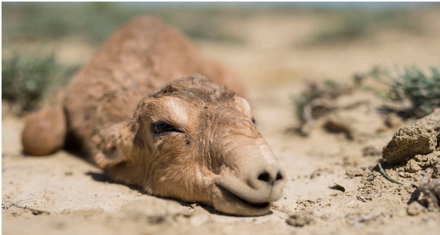
Saiga Antelope calf