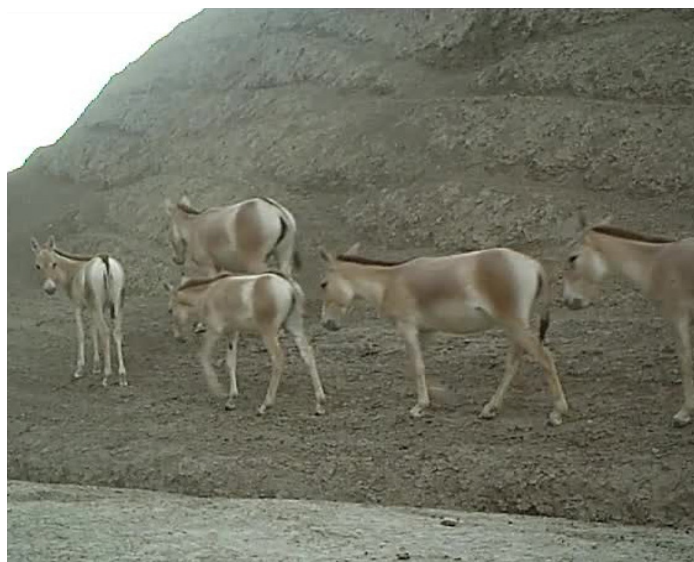
Screen shot of camera trap video from Western Kopetdag.