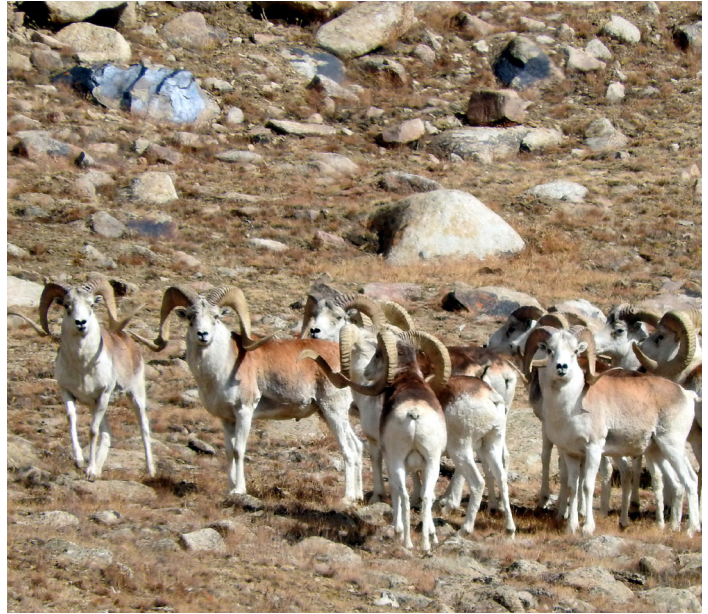
The Marco Polo Sheep ( Ovis ammon polii ), a flagship species of Afghanistan and Tajikistan, and a priority species for CAMI/CMS should benefit from the agreement on environmental protection signed in 2020 between both countries.