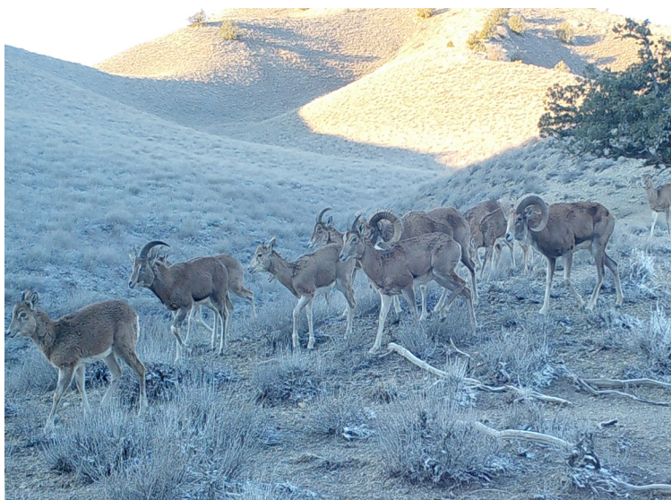
Camera trap picture of Urial in Kopetdag Reserve, Turkmenistan

With its decision to become a Party to CMS, Turkmenistan reaffirmed its commitment at the international level to the conservation of globally significant migratory animals, including migratory birds, as a country occupying a central place in the Eurasian continent. ( Karryyeva Shirin, SBSTTA/CBD Focal Point, Turkmenistan )