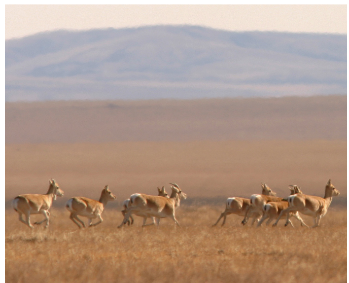
Mongolian Gazelles

To launch this new effort, we are engaging the world's leading biologists and conservationists to participate in this initiative and share information regarding the world's remaining migratory ungulates. GIUM participants include