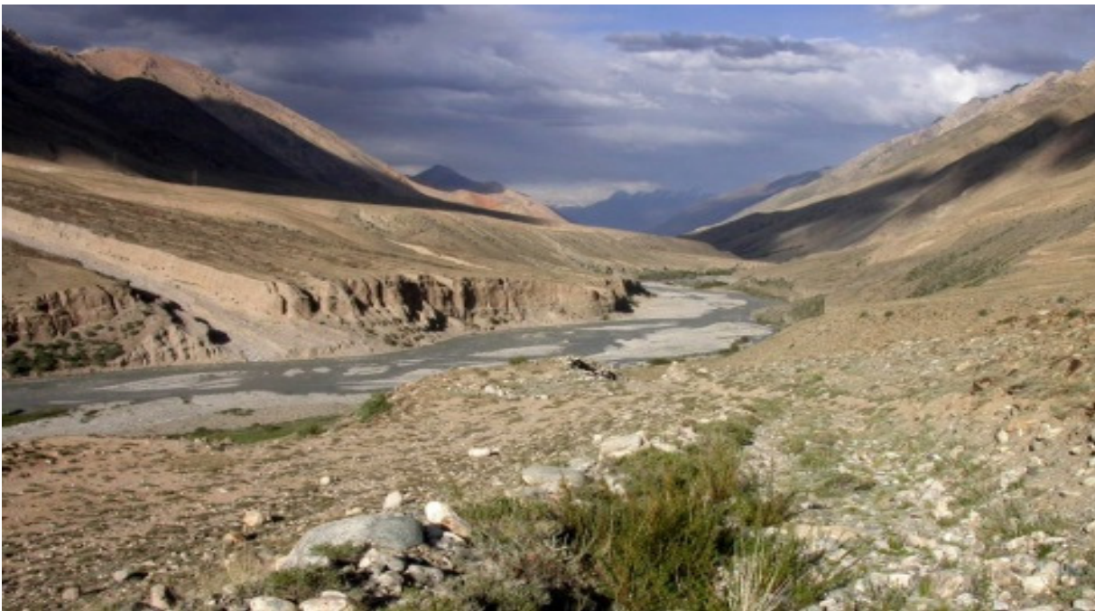
Sarychat-Eertsah Reserve.

Encompasses the area from Sarychat-Eertash SNR (1341 km 2 ) to the new Khan Tengri SNP (3257 km 2 ) on the eastern borders with China where it adjoins Tuomuerfeng (Tomur) Nature Reserve (2376 km 2 ) and Kazakhstan. It also includes Karakol SNP (160 km 2 ), and the Dzhety-Oguz (300 km 2 ) and Tyup (150 km 2 ) sanctuaries, and the area between, most of which is occupied by hunting concessions. Also included is Jangart, lying between the southern side of Sarychat-Eertash to the border. The landscape also potentially extends westwards to 4a Naryn SNR (183 km 2 ) and sanctuary (400 km 2 ), with which it is connected by more hunting concessions. The GEF/UNDP Central Tien Shan Project is planning to establish wildlife corridors covering 2663 km 2 between SCEZ and KTNP (section 3.2). Most of the Kyrgyz sector and Tomur Reserve in China are included in the GSLEP 20 x 2020.