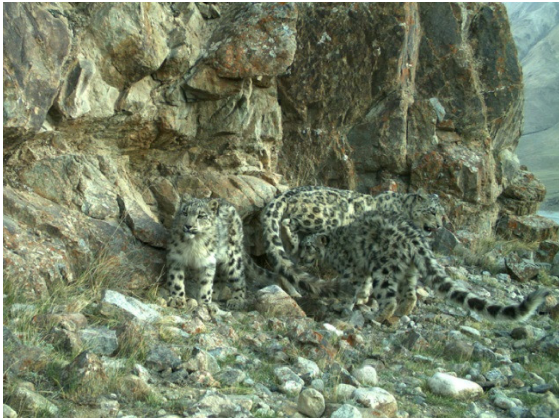
Camera-trapped snow leopard family, Sary-Chat-Eertash Reserve.