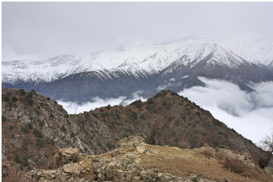
Hissar Range.

Consists of the Hissar, Turkestan and Zeravshan ranges that extend for approximately 500 km east to west and separated by the Alai Valley from the main Pamir system. Protected Area coverage is limited to Hissar SNR (810km 2 ), Zaamin SNR (248 km 2 ) and Zaamin NP (241 km 2 ) in Uzbekistan and Kulun-Ata State Reserve (277 km 2 ) in Kyrgyzstan. Most of this area is one of the GSLEP 20 x 2020.