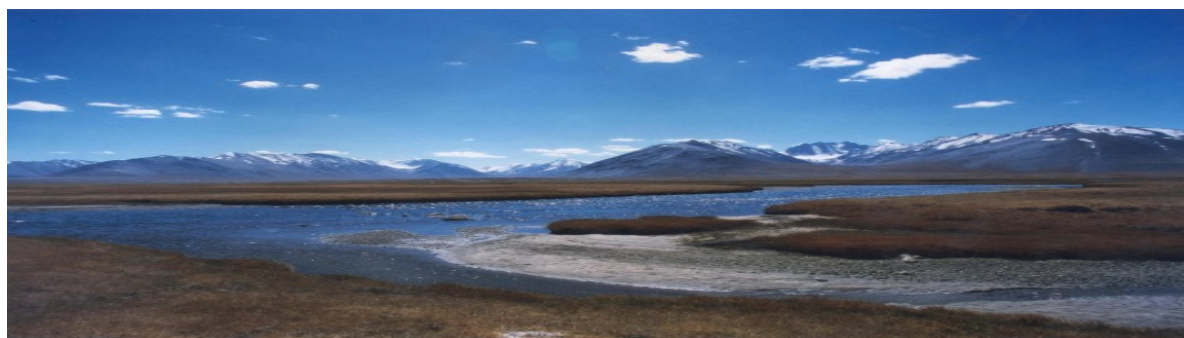
Zorkul, Eastern Pamir.

Covers the South Alichur, Wakhan and Sarykol ranges in Tajikistan, the Afghan and Chinese Pamir and a small area of Pakistan. Includes Zorkul SNR (877 km 2 ), Murgab hunting management area (2000 km 2 ), and Vakhn hunting management area in Tajikistan; Wakhan NP (11,457 km 2 ) in Afghanistan, which itself covers Big Pamir Wildlife Reserve (577 km 2 ) and Teggermansu Wildlife Reserve (248 km 2 ); Taxkorgan NR (15,863 km 2 ) in China, and Khunjerab NP (2269 km 2 ) and Kilik-Mintaka Game Reserve (650 km 2 ) in Pakistan. The landscape thus described is broadly the same as the Pamir International Conservation Area (Schaller 2005, WCS 2007), coincides with the distribution of the Marco Polo sheep Ovis ammon polii and encompasses GSLEP landscapes in Afghanistan, China, and Tajikistan.