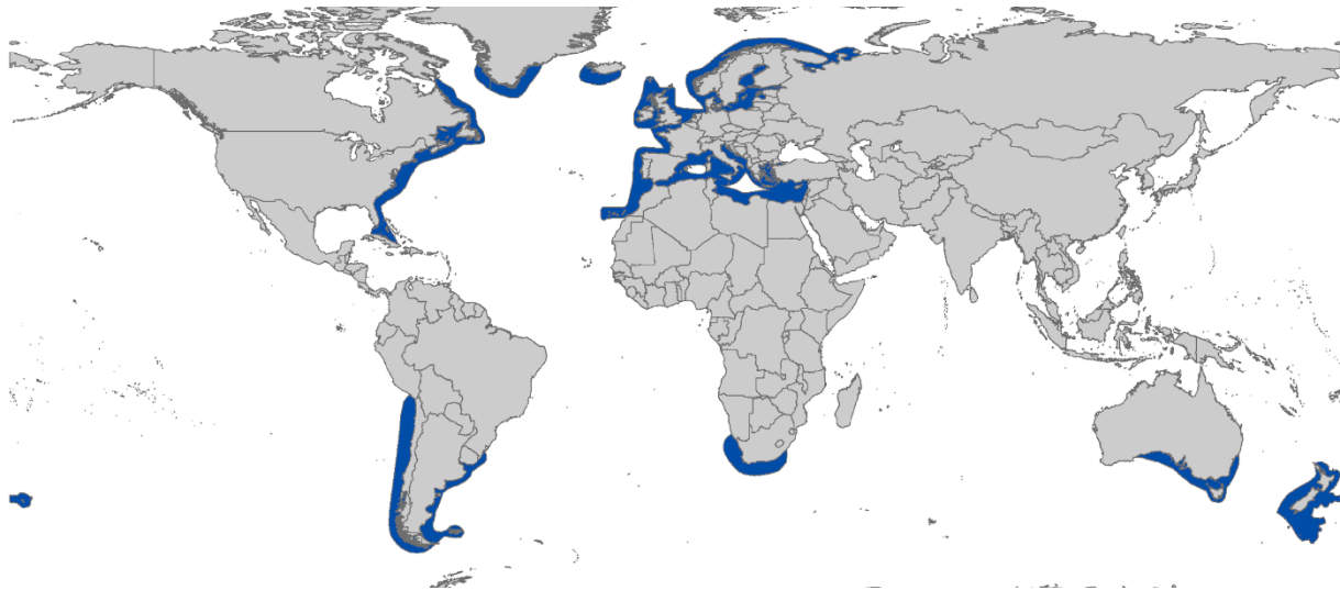
Figure 1: Distribution of Spiny Dogfish ( Squalus acanthias ) i .

Spiny Dogfish is distributed in both northern and southern temperate and boreal waters, but the species is listed on the MOU for the northern hemisphere populations only. Northern hemisphere subpopulations occur in the Northeastern and Northwestern Atlantic, Mediterranean Sea and Black Sea.